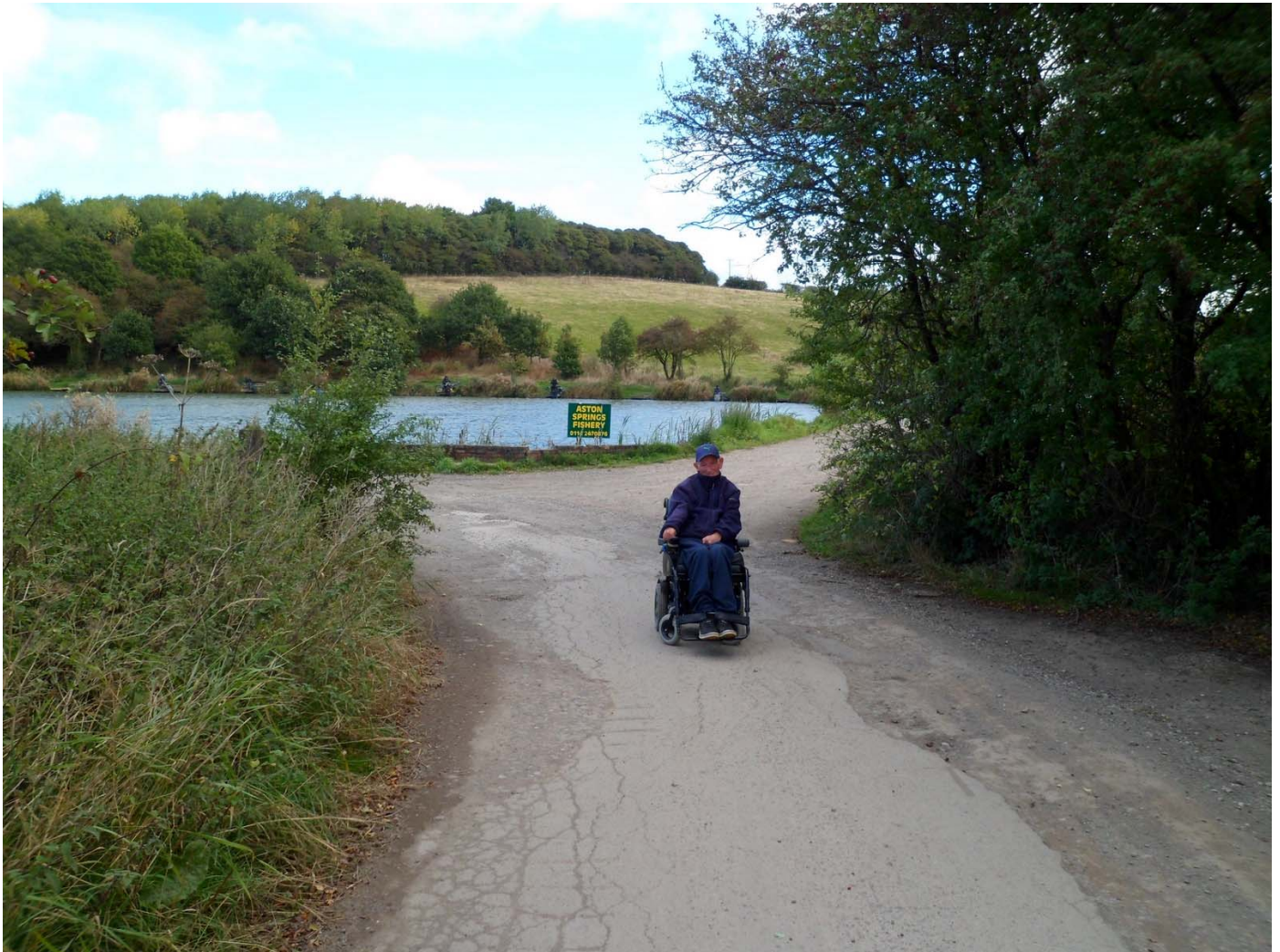
Concrete Lane Surface

From the Farm Shop is a gravel path where you can view the lakes and this leads to the lane which is made up of a concrete surface which has some pot holes - it is suitable for motorised wheelchairs, but manual wheelchairs / pushchairs will need a pusher. It is a forward and back walk