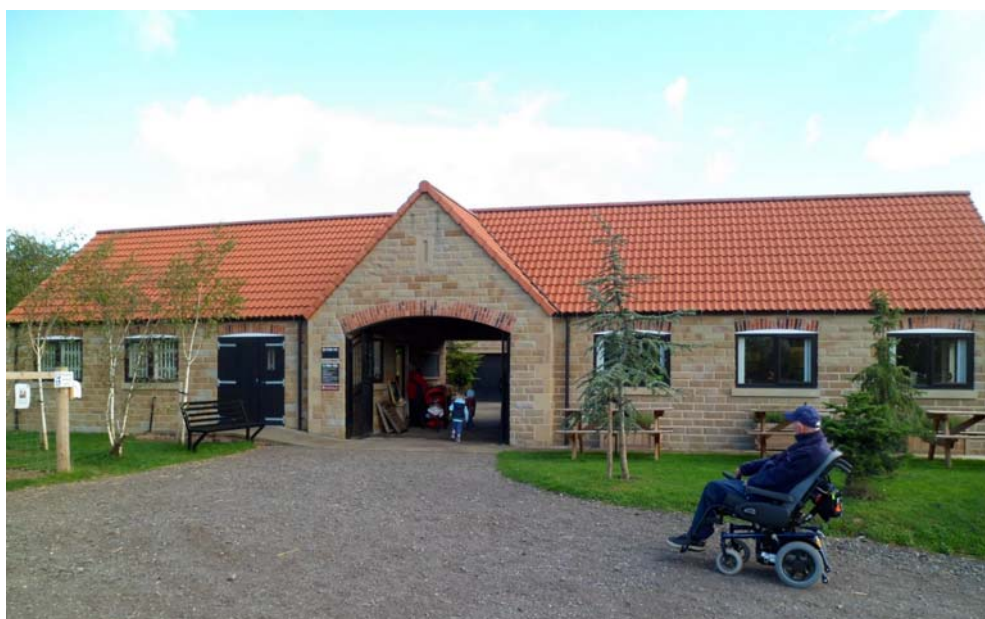
Farm Shop & Café