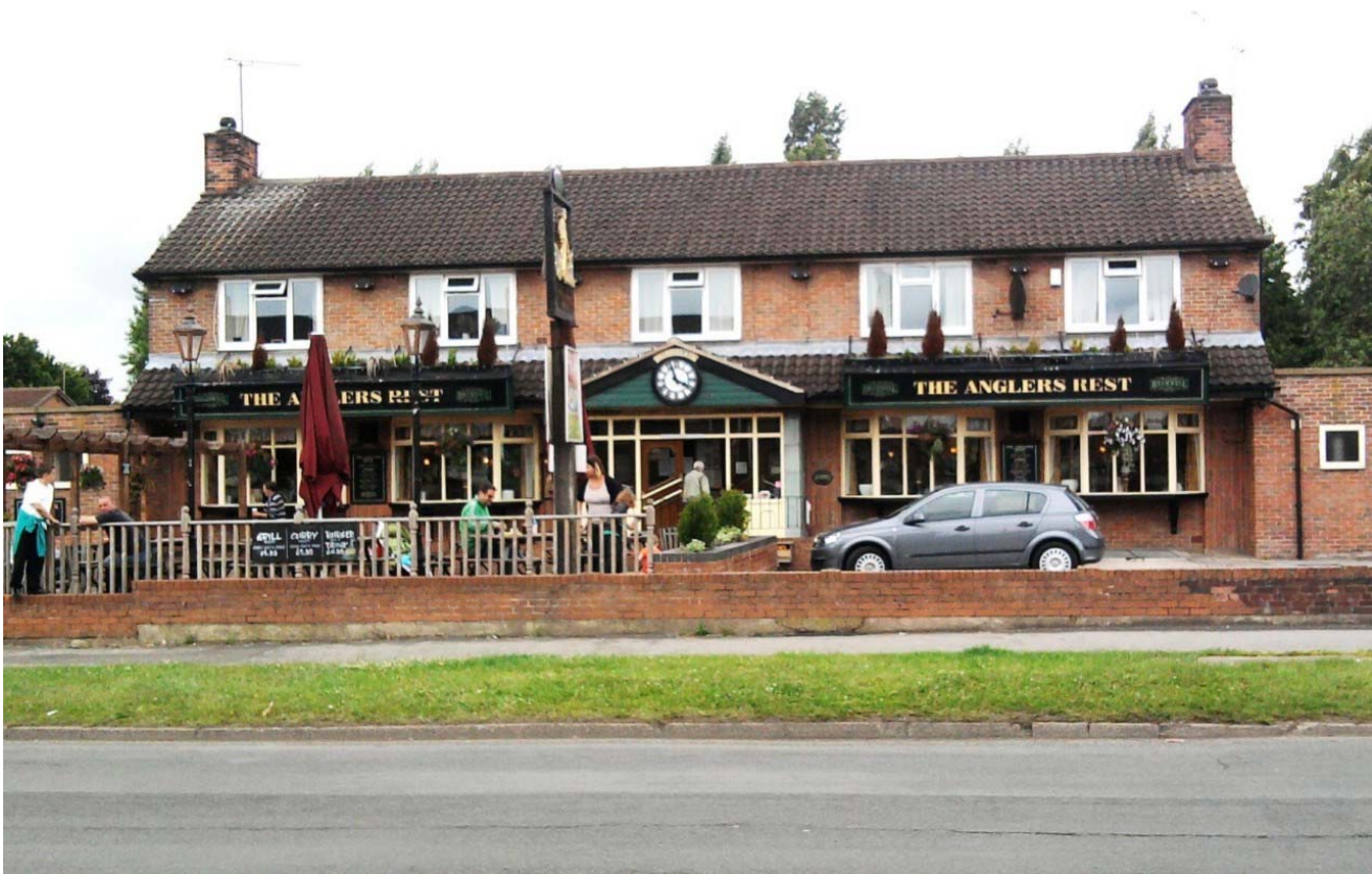
The Anglers Rest Inn