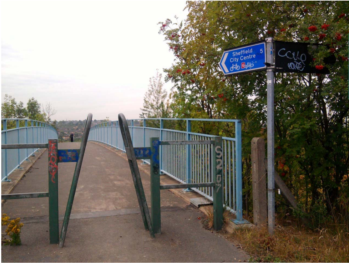
Bowden Woods Rolled-in Stone/Clay Path