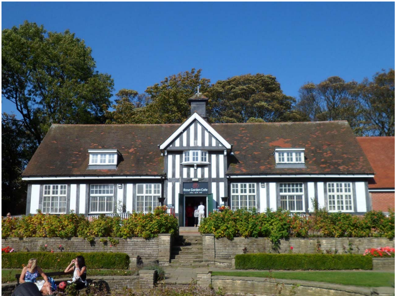
Rose Garden Café