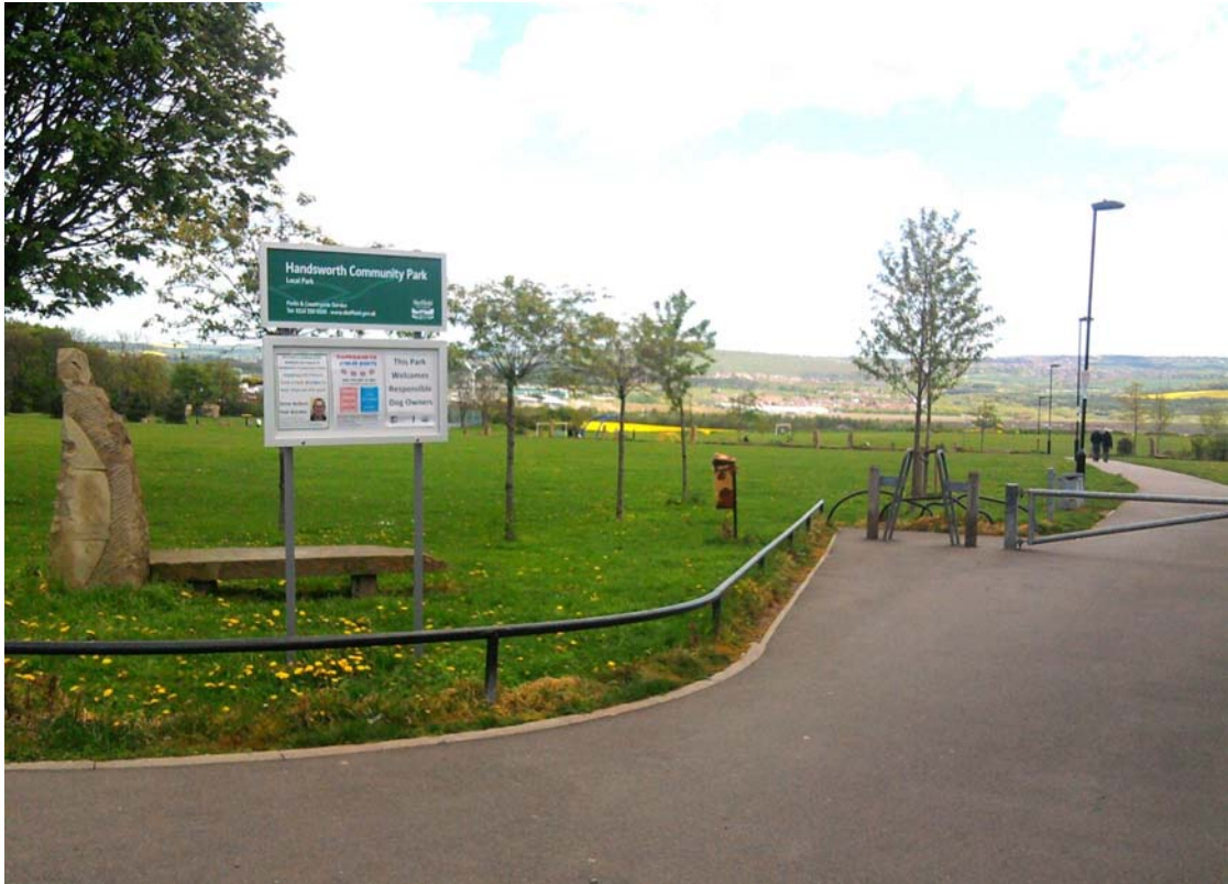
Handsworth Park Tarmac Path