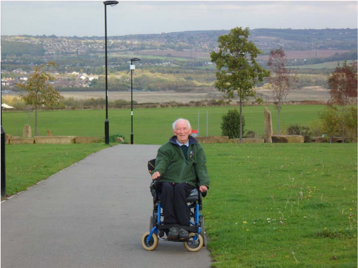
Handsworth Park View