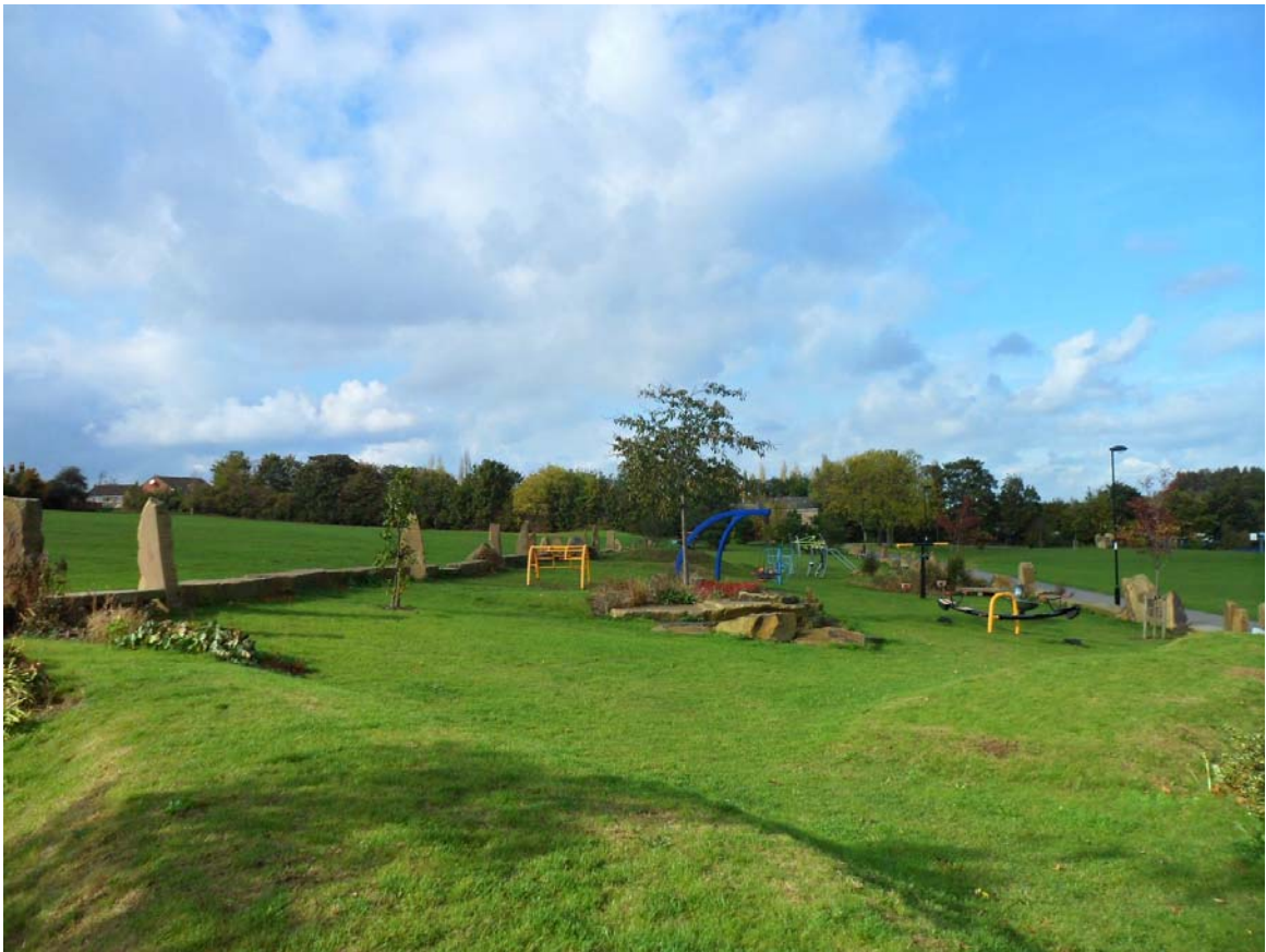
Children's Activity Frames