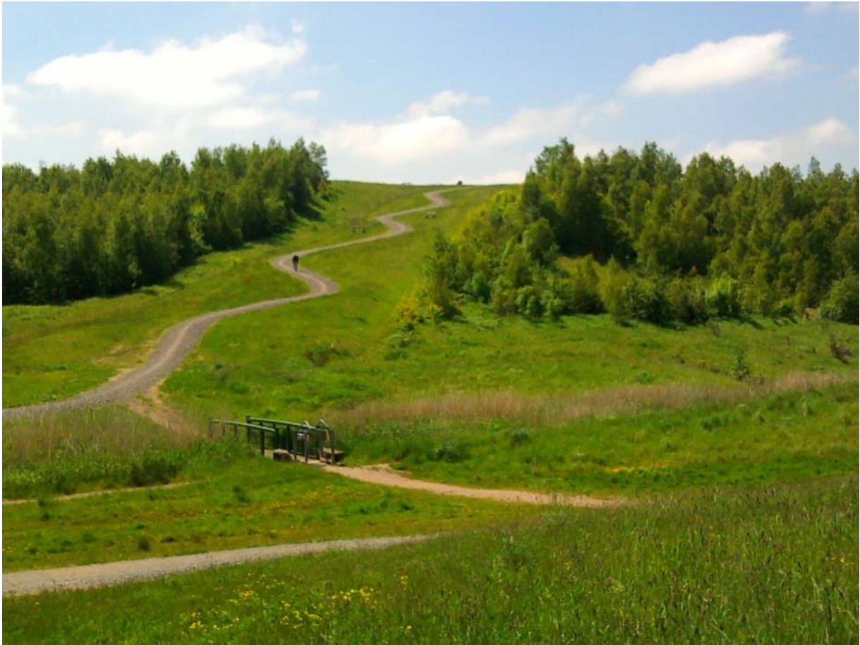
View of the hill & zigzag path for walkers