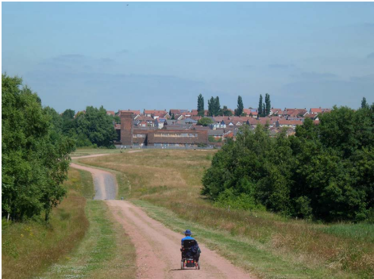
Path up to the hill