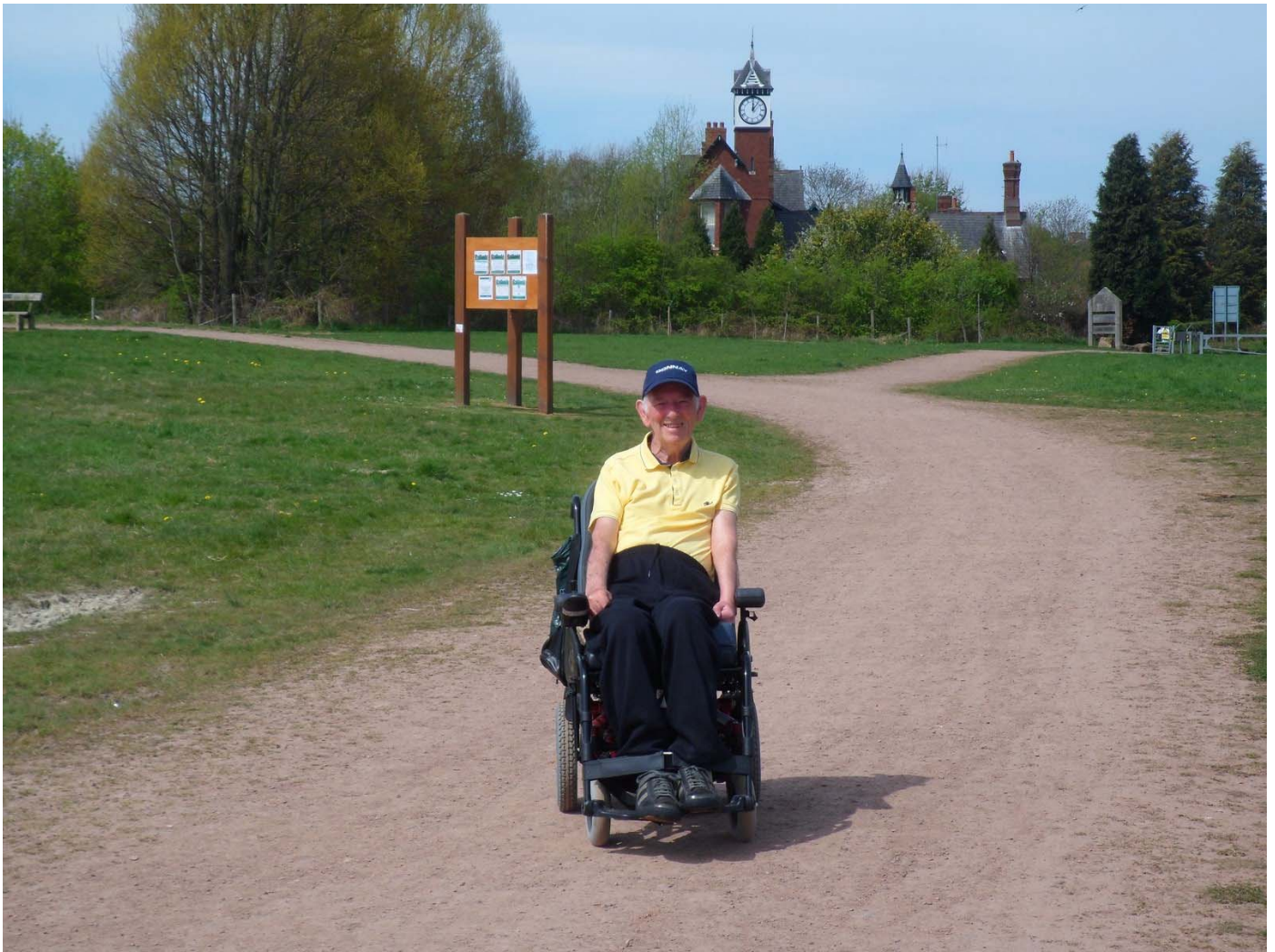
Entrance to the park