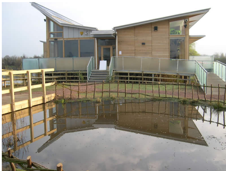
Attenborough Nature Centre and Cafe