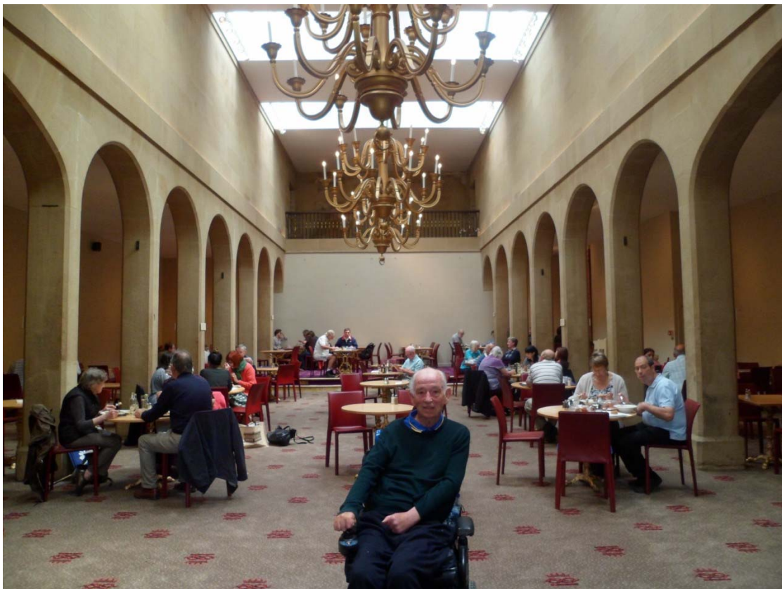
Chatsworth ‘Stables’ Café

● Café – At Chatsworth House ‘The Stables’ has a restaurant and a large self service café with a large seating area, there is also a seating outside – There is also a small snack restaurant near the toilets – Baslow has a few café’s and 3 local inns.