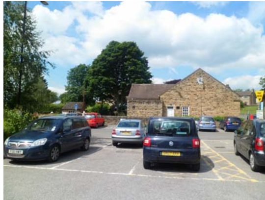
Baslow car park