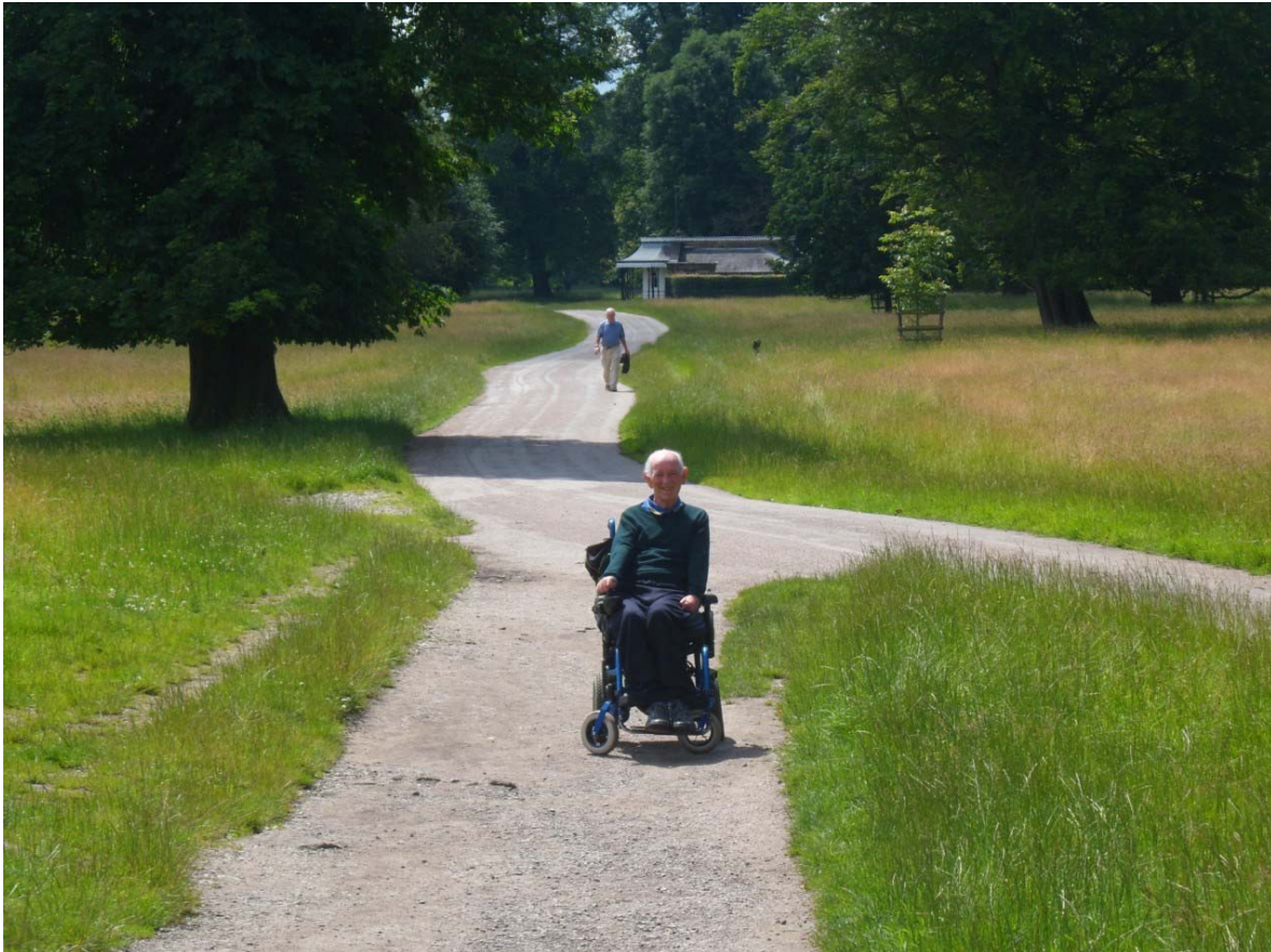
Crushed Stone Path

Also for people in manual wheelchairs you can park at Chatsworth House and there are a few flat areas, but also a steep hill up to ‘The Stables’, which will require a strong pusher. I have also shown on the walk quite a very steep tarmac path upto the Tower.