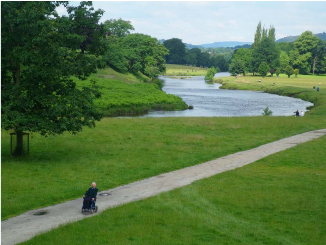
View from Queen Mary's Bower