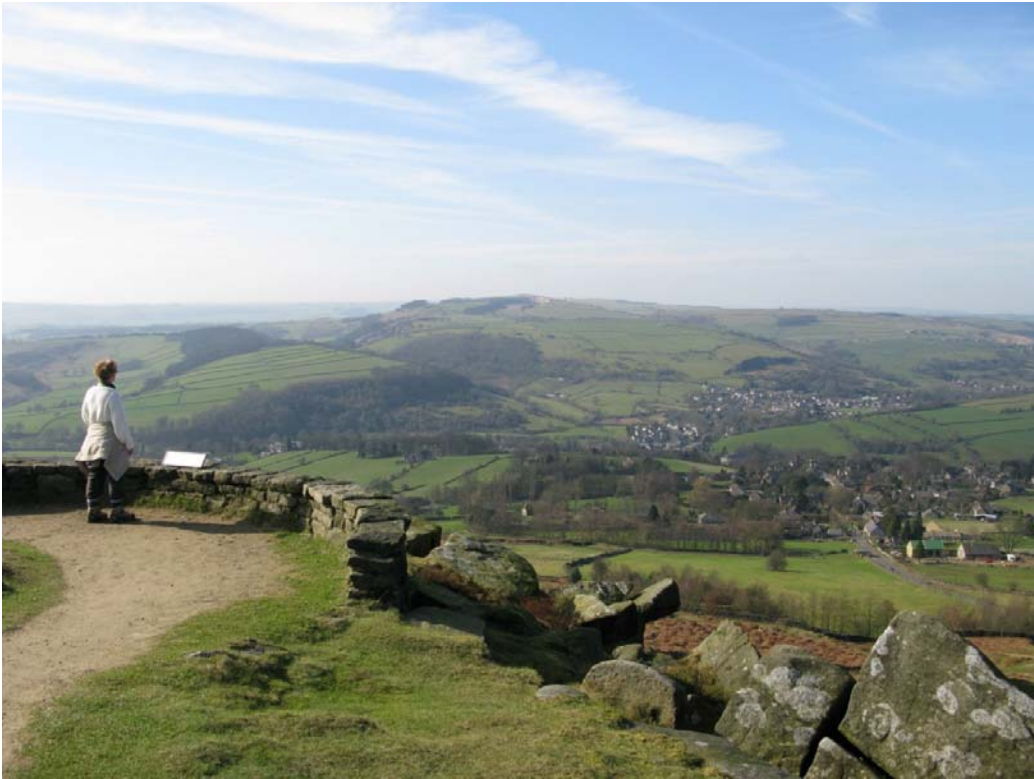
Crushed Stone Path