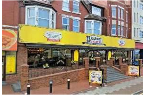
Bispham Kitchen Café