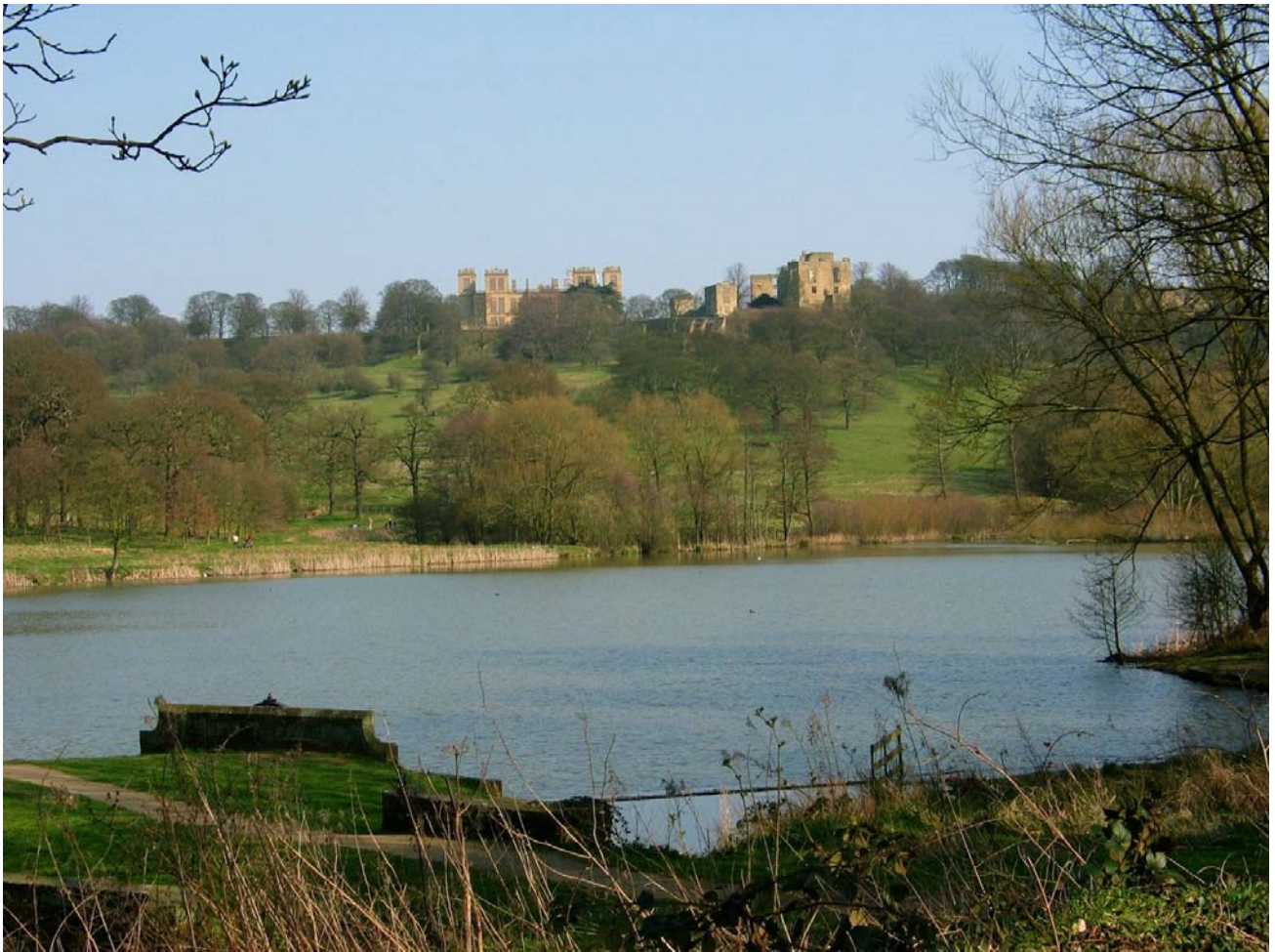
Millers Pond and view