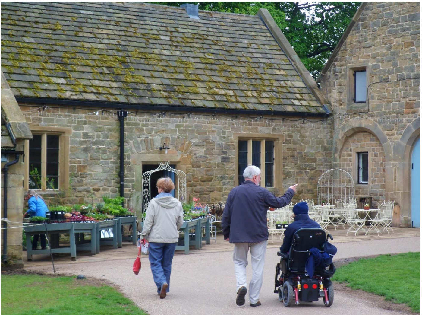
Craft shops and crushed stone path

There are many other paths for walkers to explore the picturesque parkland on one of the circular walks.