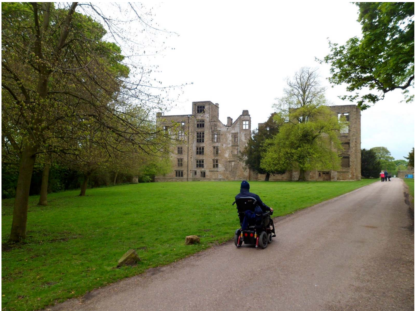
Ruins of Old Hall