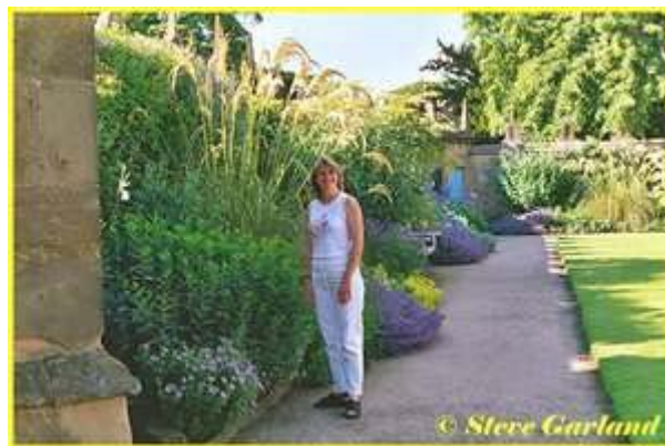
Garden Crushed Stone Path