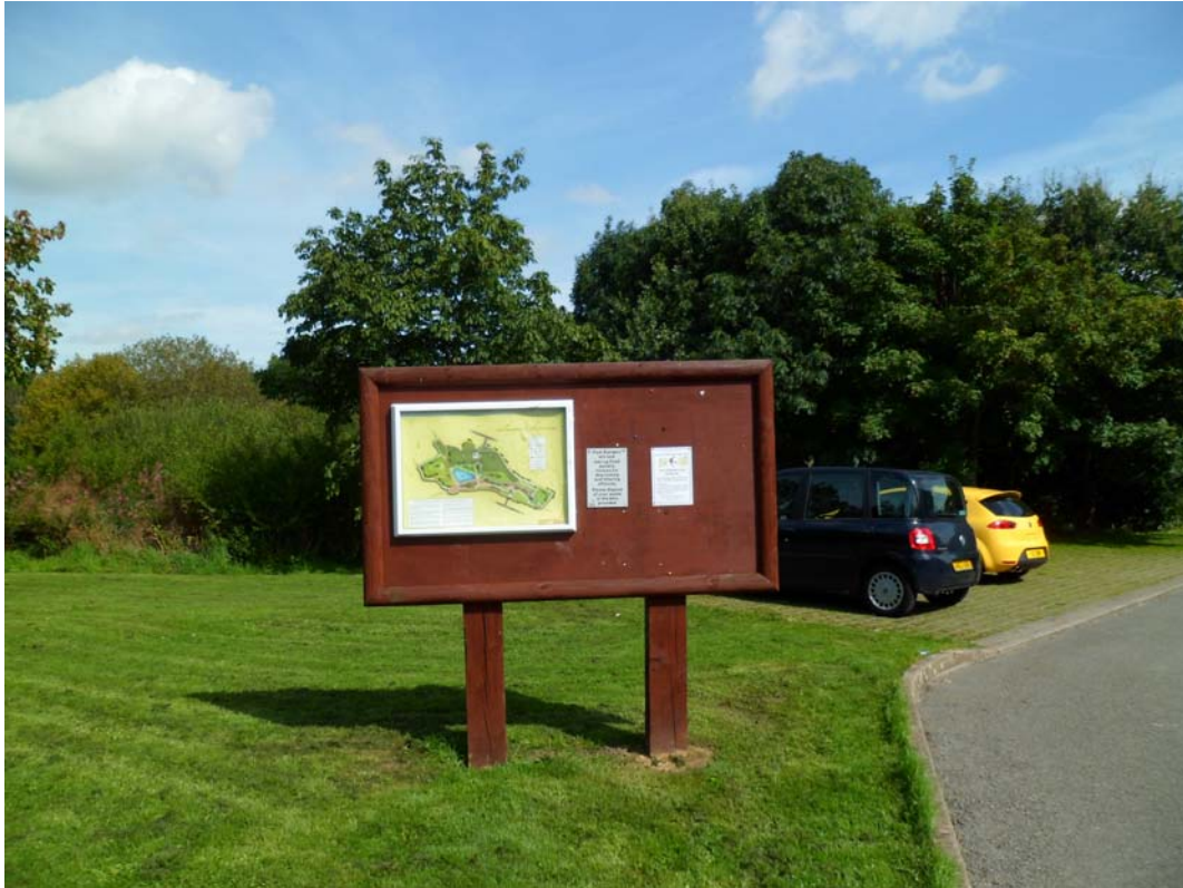
Lower Car Park