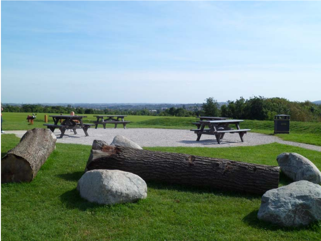
Picnic Tables near café with view