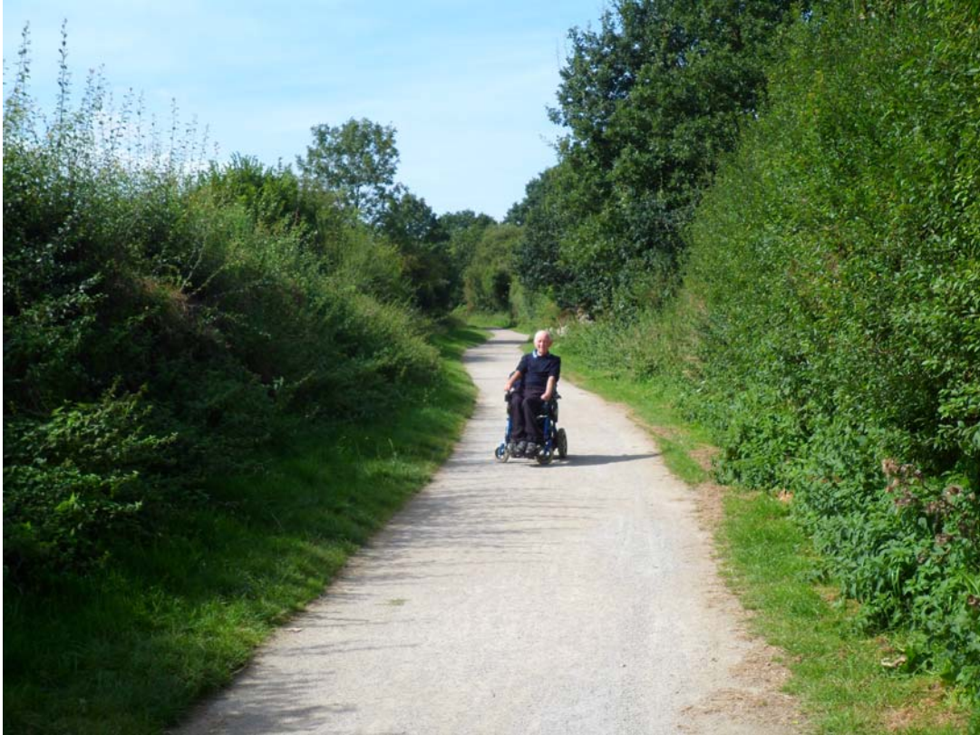
Crushed Stone Path

There is plenty of seating around the park with litter-bins and some dog litter-bins.