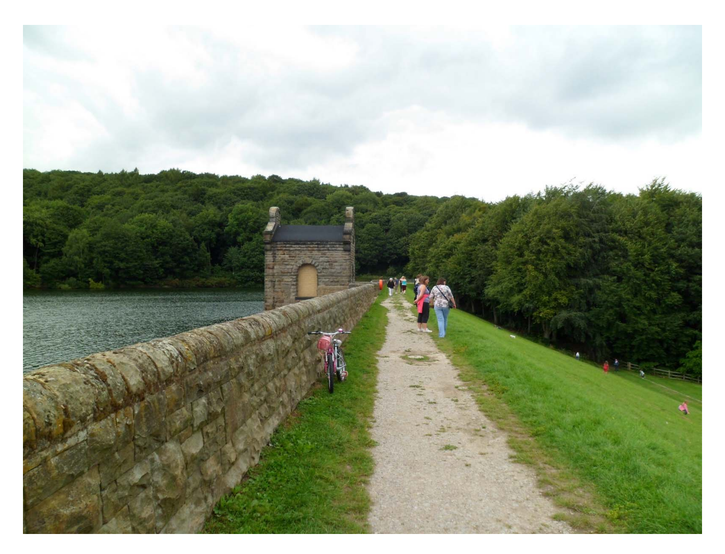
Crushed Stone Path