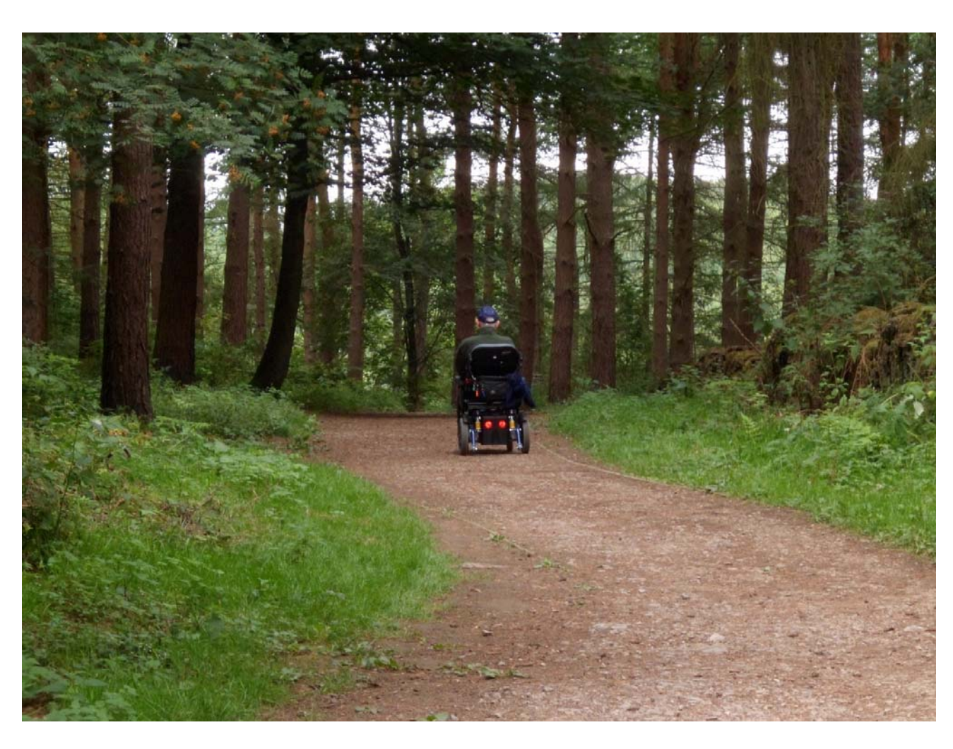
Pine Tree Forest