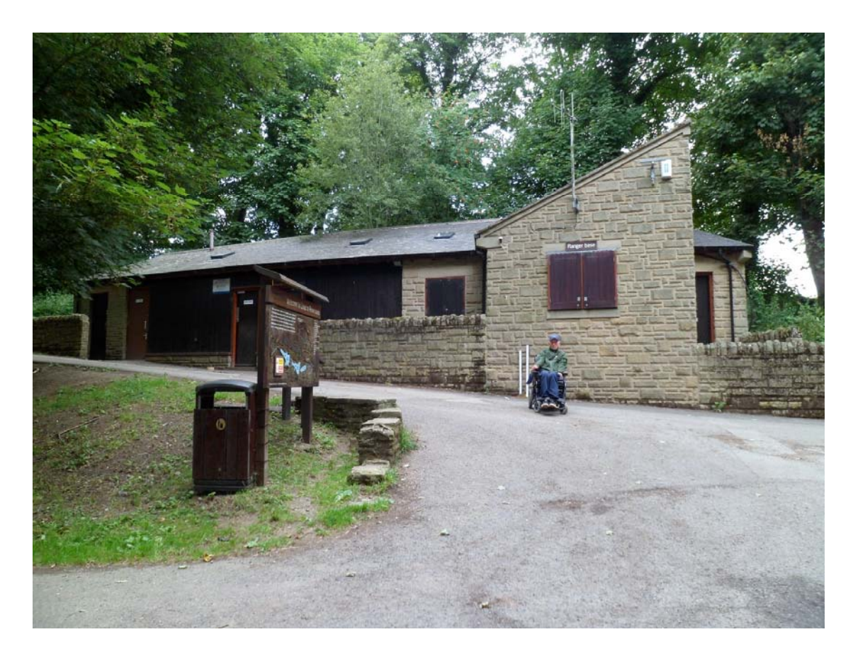
Park Rangers Office & Toilets