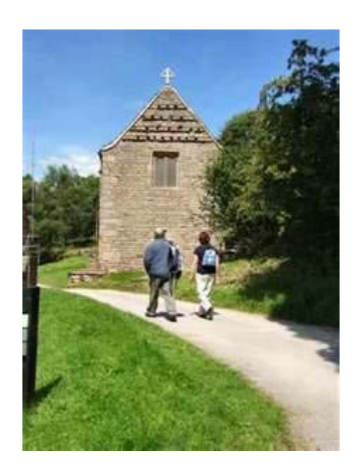
Path to Chapel

Places to visit nearby – Hathersage – Fox House – Longshaw - Castleton – Ladybower Reservoir – Chatsworth.