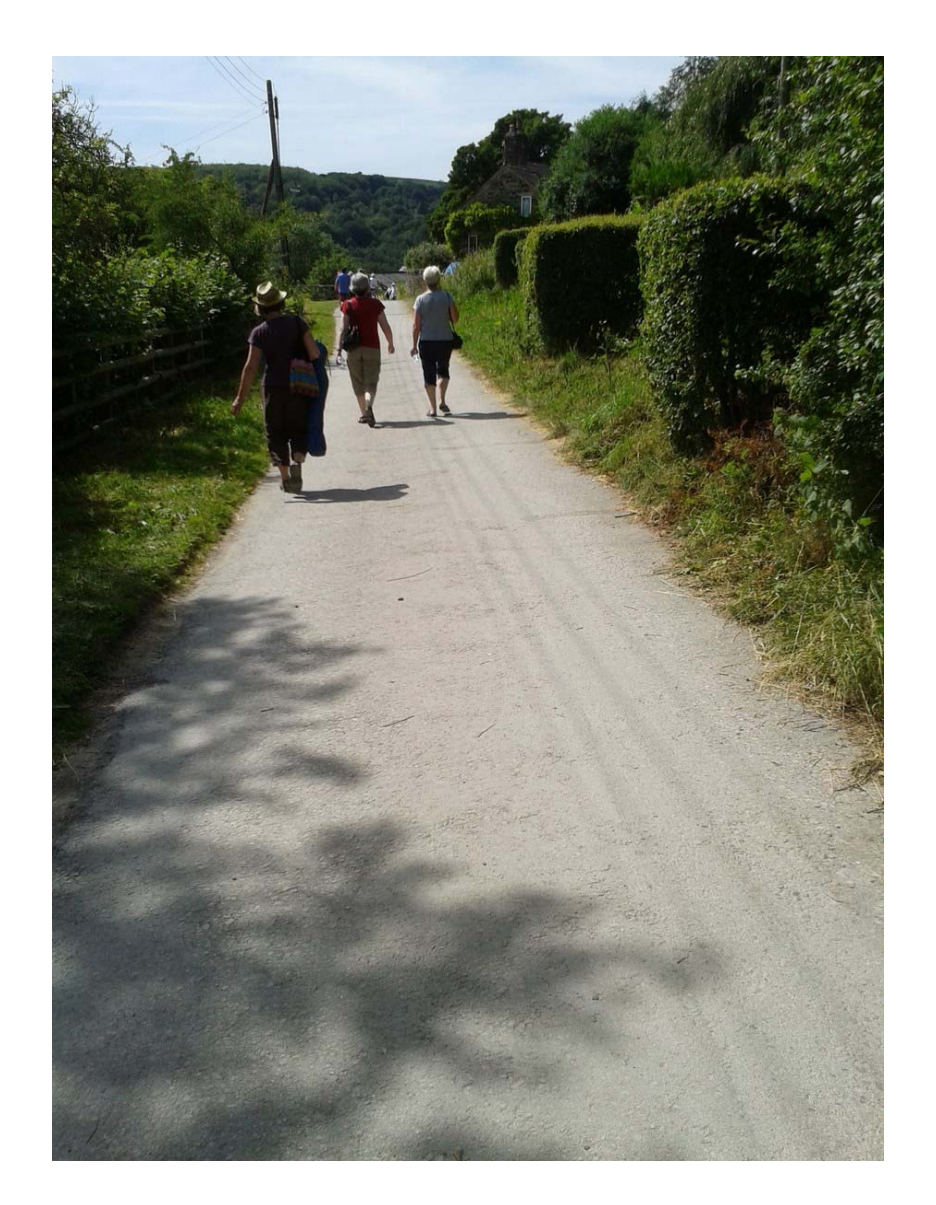
Crushed Stone Pathway