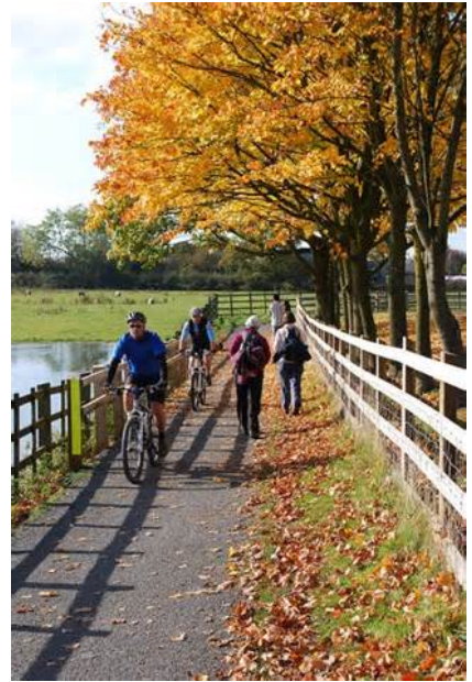
Crushed Stone Path