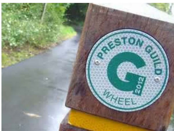
Guild Walk Sign