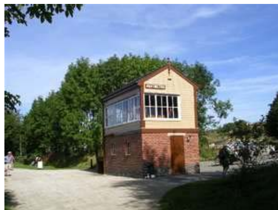
Hartington Signal Box