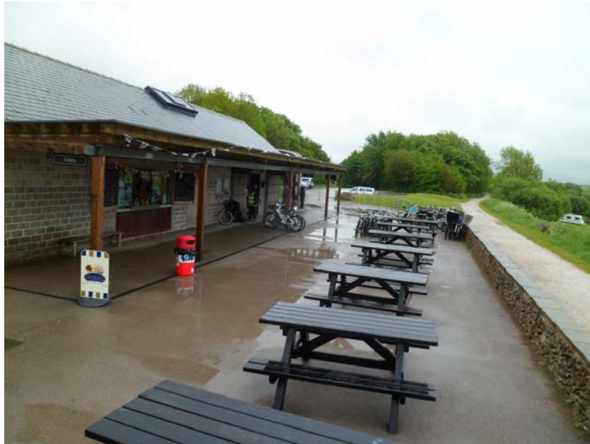
Parsley Hay Café