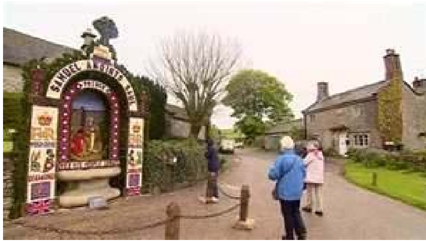
Tissington Well Dressing