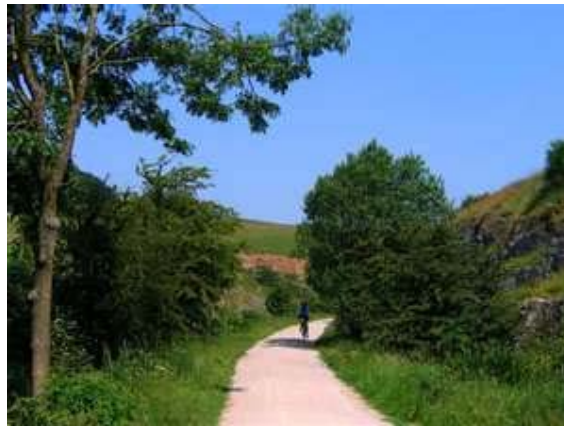
Crushed Stone Path

You will need to pick a parking place to start your walk as it is a there / back journey