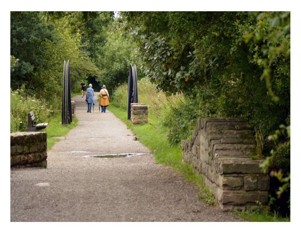
Crushed Stone Path

• Path – There are various routes in the park with a disabled friendly route with a good surface for wheelchairs.