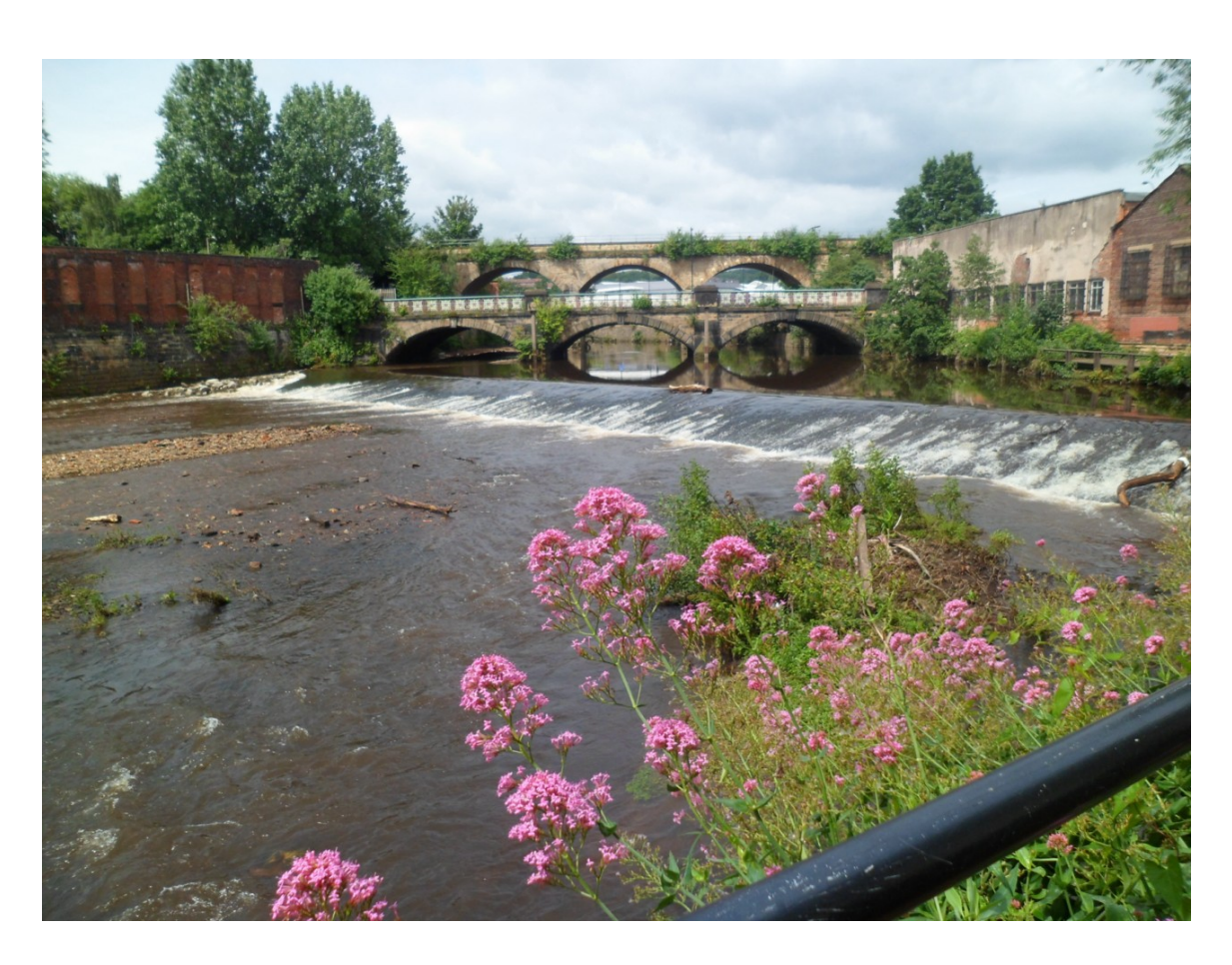
Walk Mills Weir