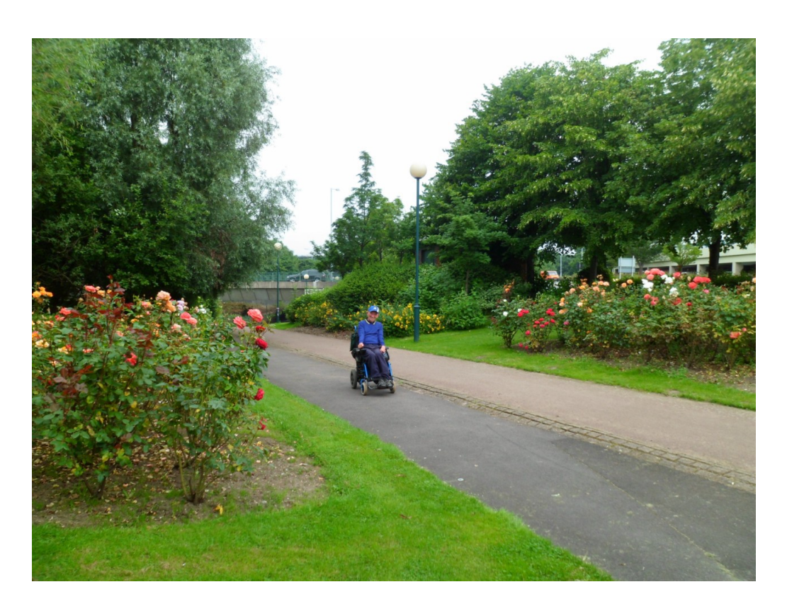
Path near Meadowhall