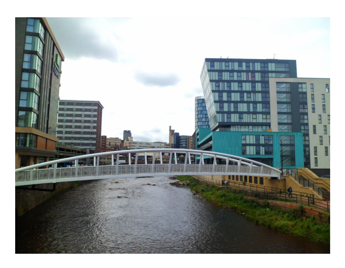
Offices near Sheffield