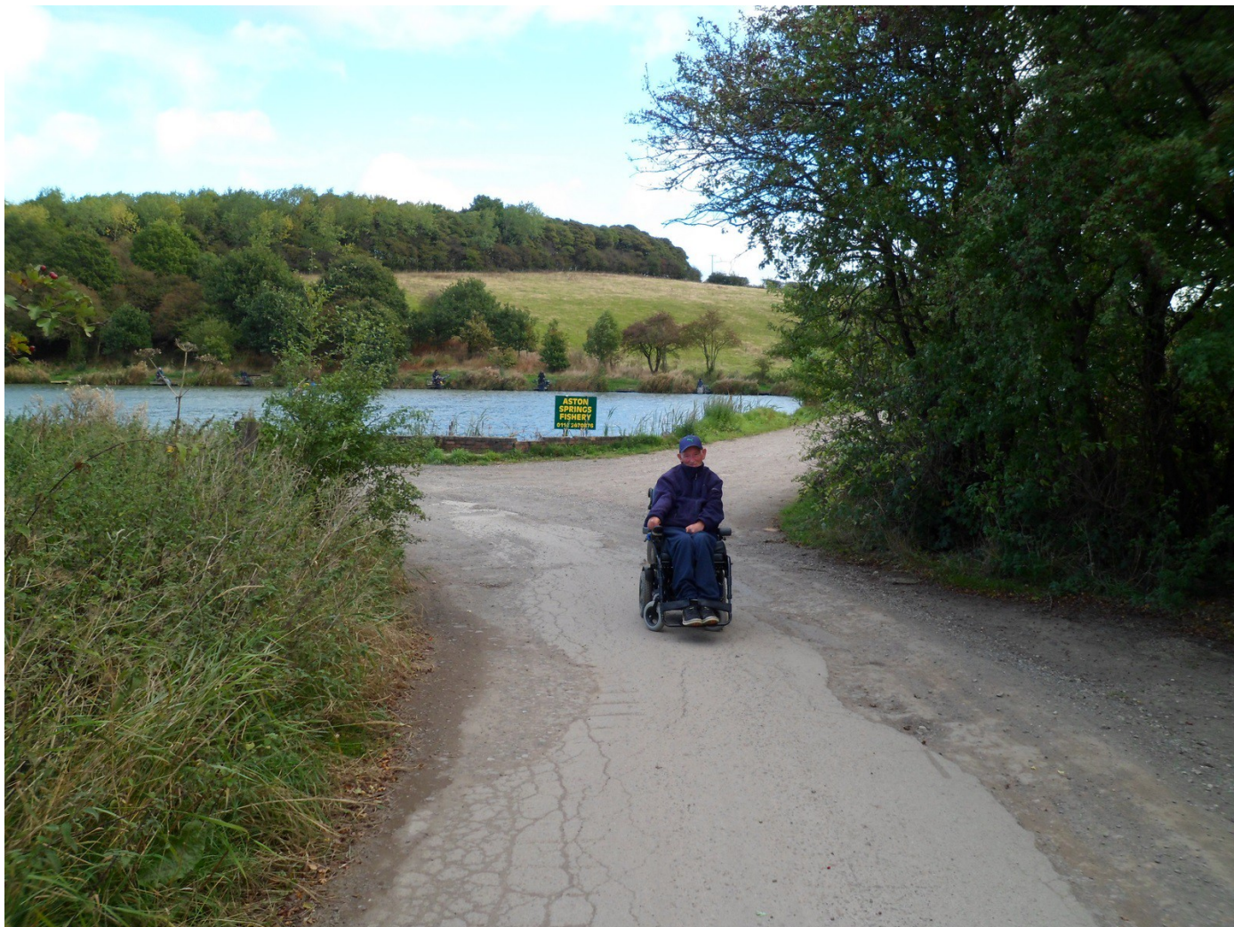
Concrete Lane Surface

From the Farm Shop is a gravel path where you can view the lakes and this leads to the lane which is made up of a concrete surface which has some pot holes - it is suitable for motorised wheelchairs, but manual wheelchairs / pushchairs will need a pusher. It is a forward and back walk