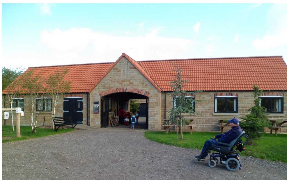
Farm Shop & Café