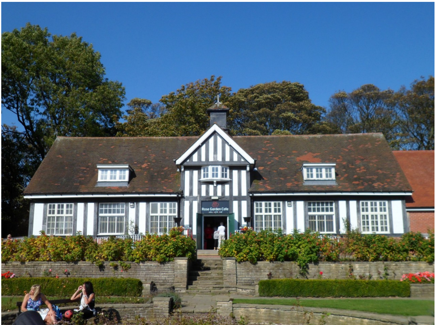
Rose Garden Café