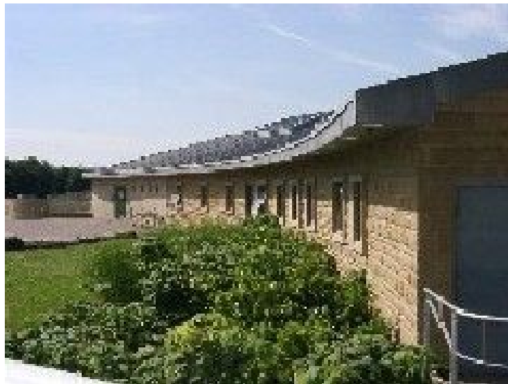
Centre in the Park Cafe