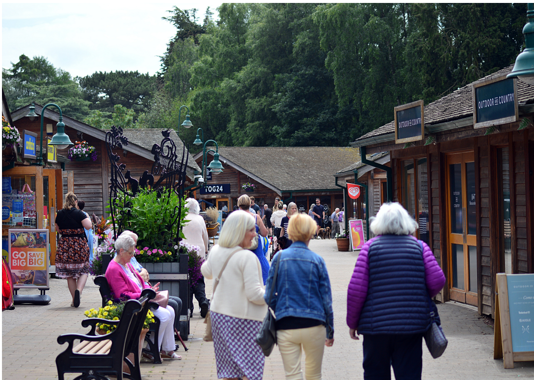
Trentham Estate Outlet Centre