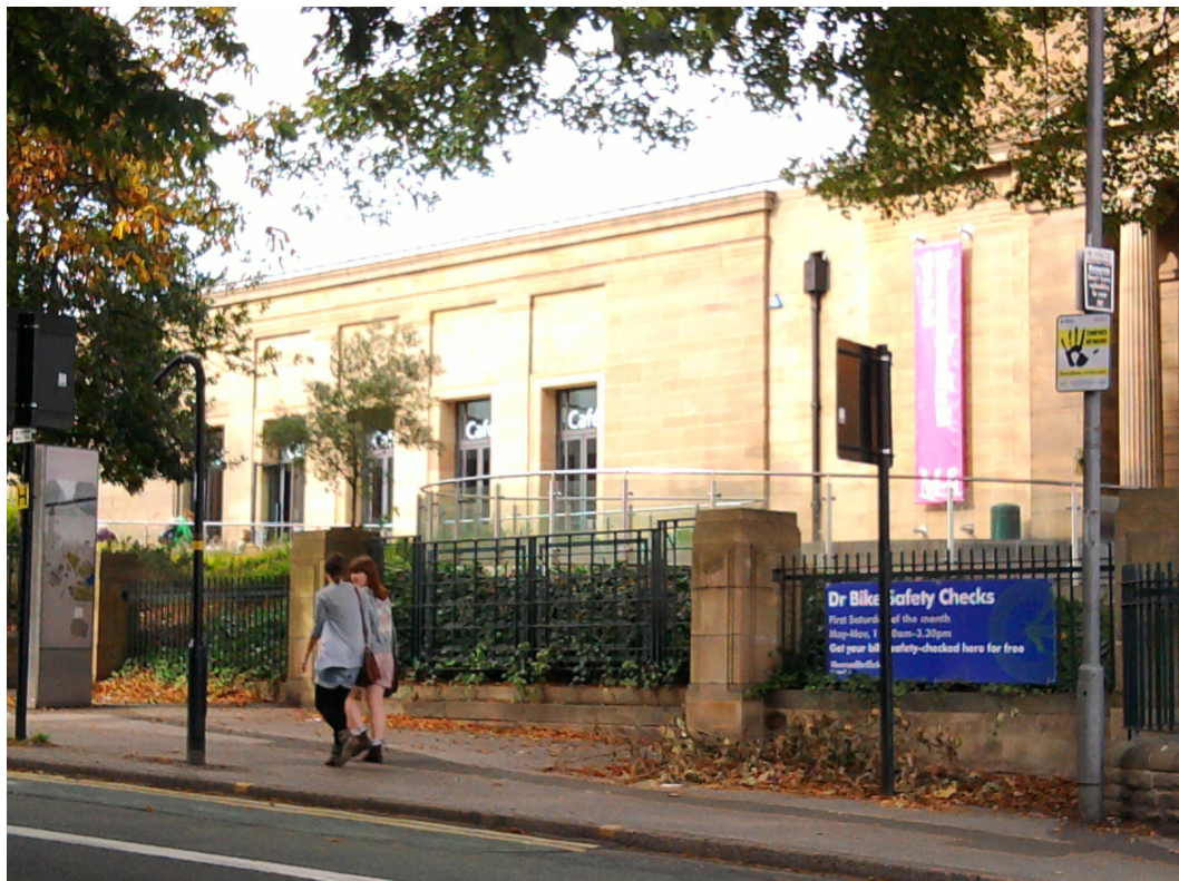
Museum Park Café