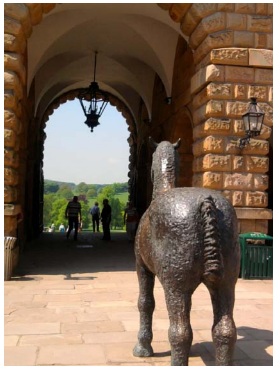
'The Stables' Entrance