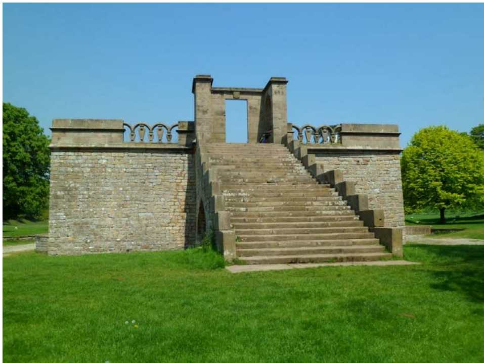
Queen Mary's Bower