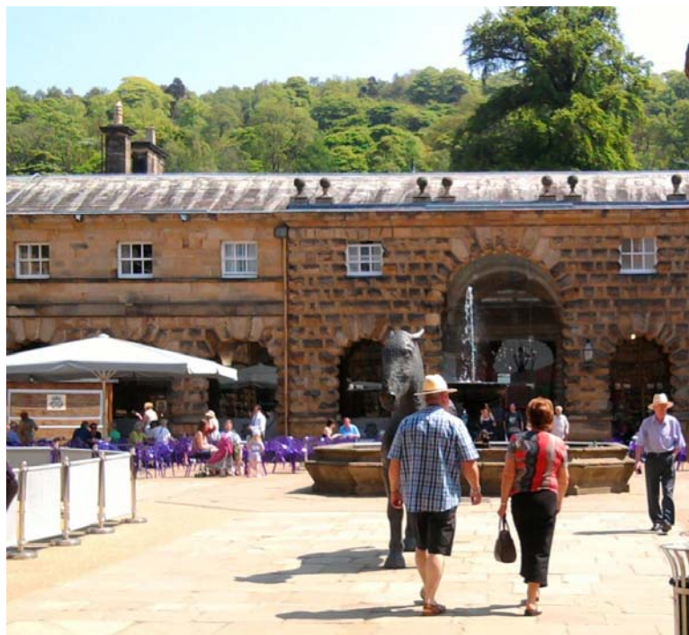
‘The Stables’ Restaurant and tearoom

● Café – Edensor has a Tea Cottage in the old post office where you can obtain snacks and a meal – at Chatsworth House ‘The Stables’ has a restaurant and a large self service café with a large seating area, there is also a seating outside – There is also a small snack cafe near the garden area.