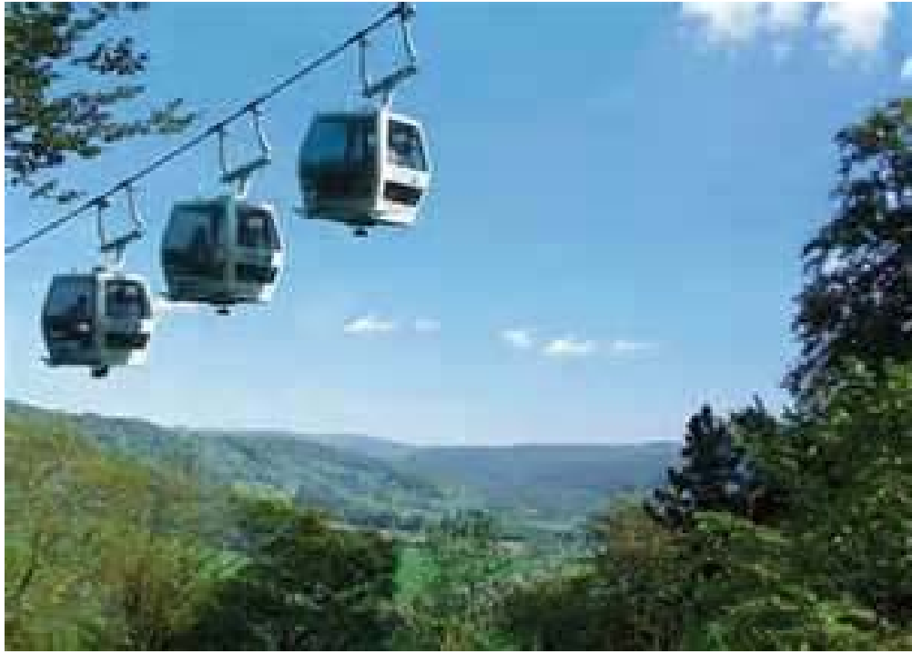
Heights of Abraham