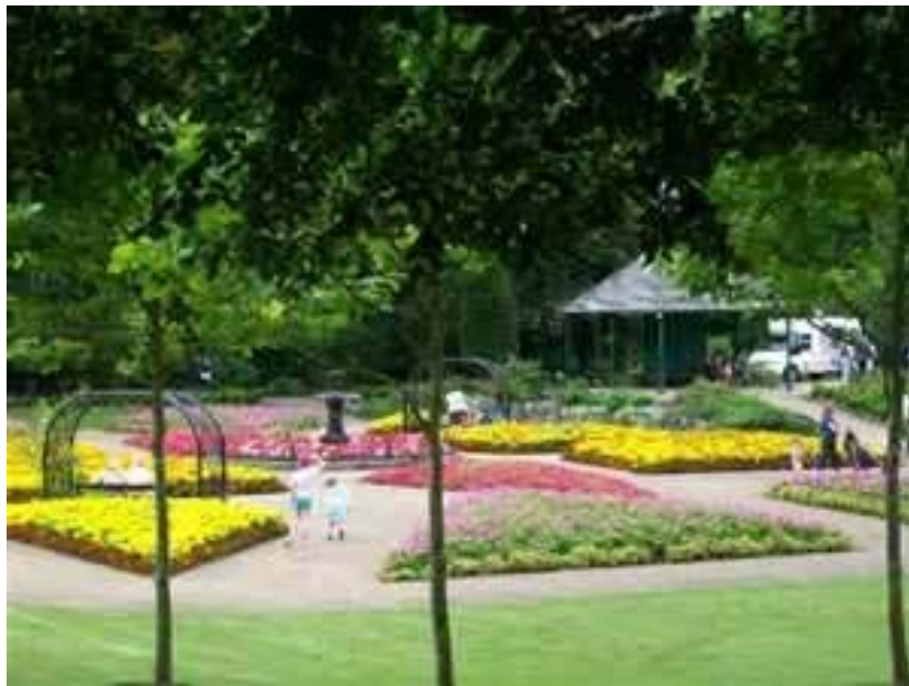
Matlock Park Gardens