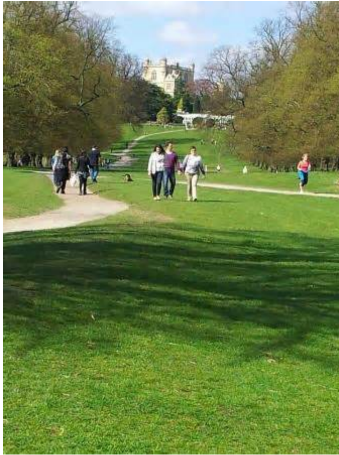
Crushed Stone Path

See gallery for Information – Wollaton Hall & Park not visited yet.