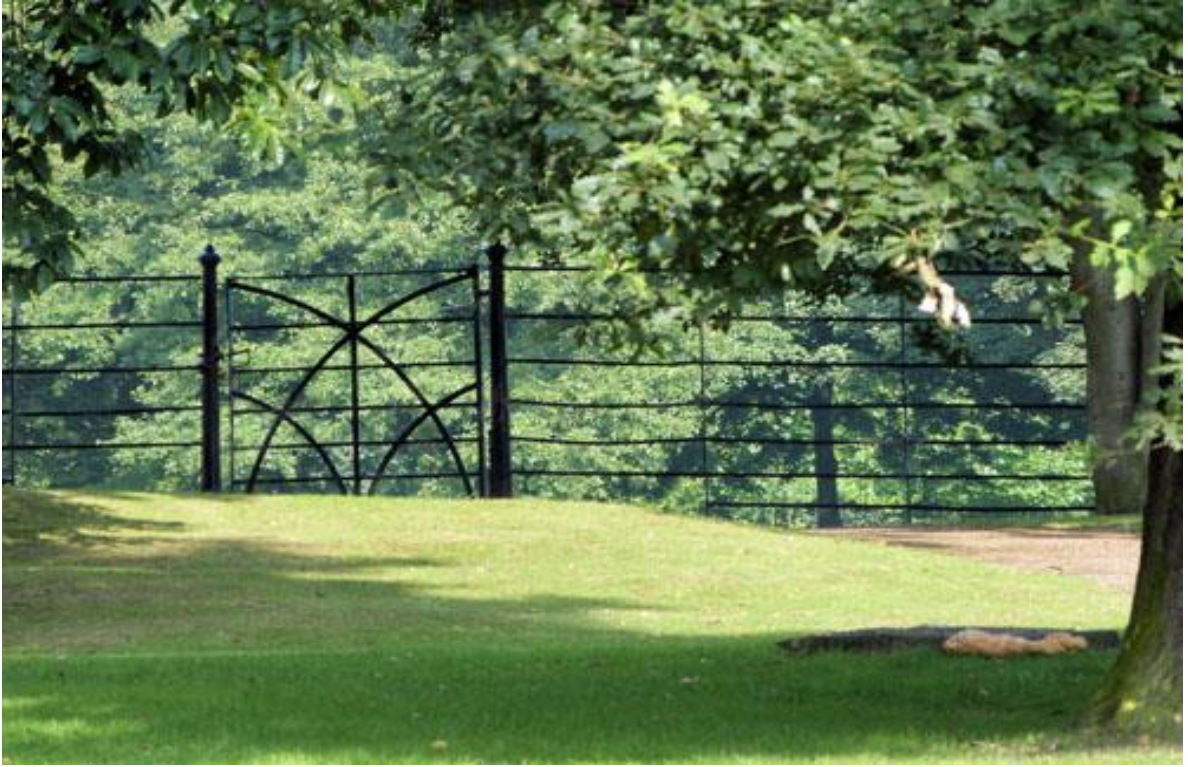
Walk and access gate