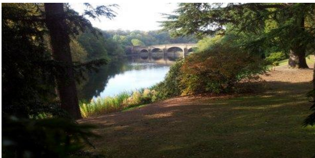
Crushed stone path in grounds