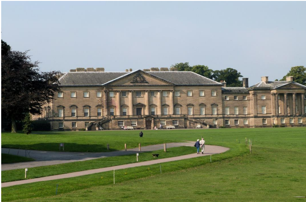
Tarmac path to house