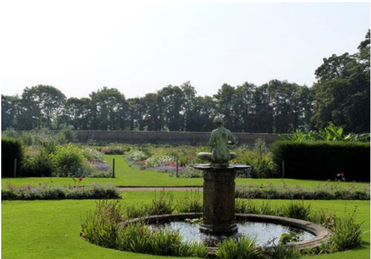
Gardens and Orchard