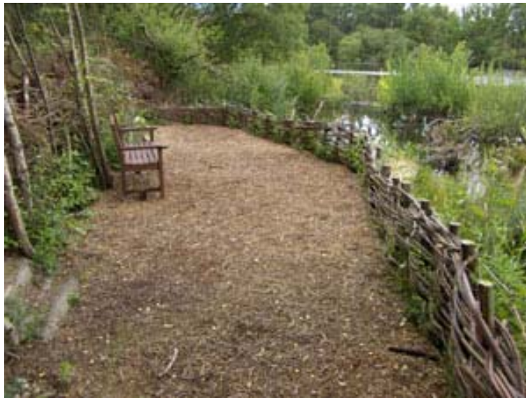
Willow Lake Seat