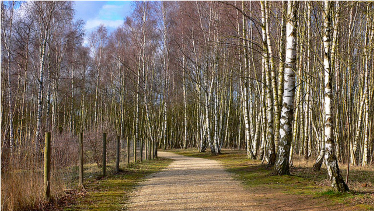
Crushed Stone Path