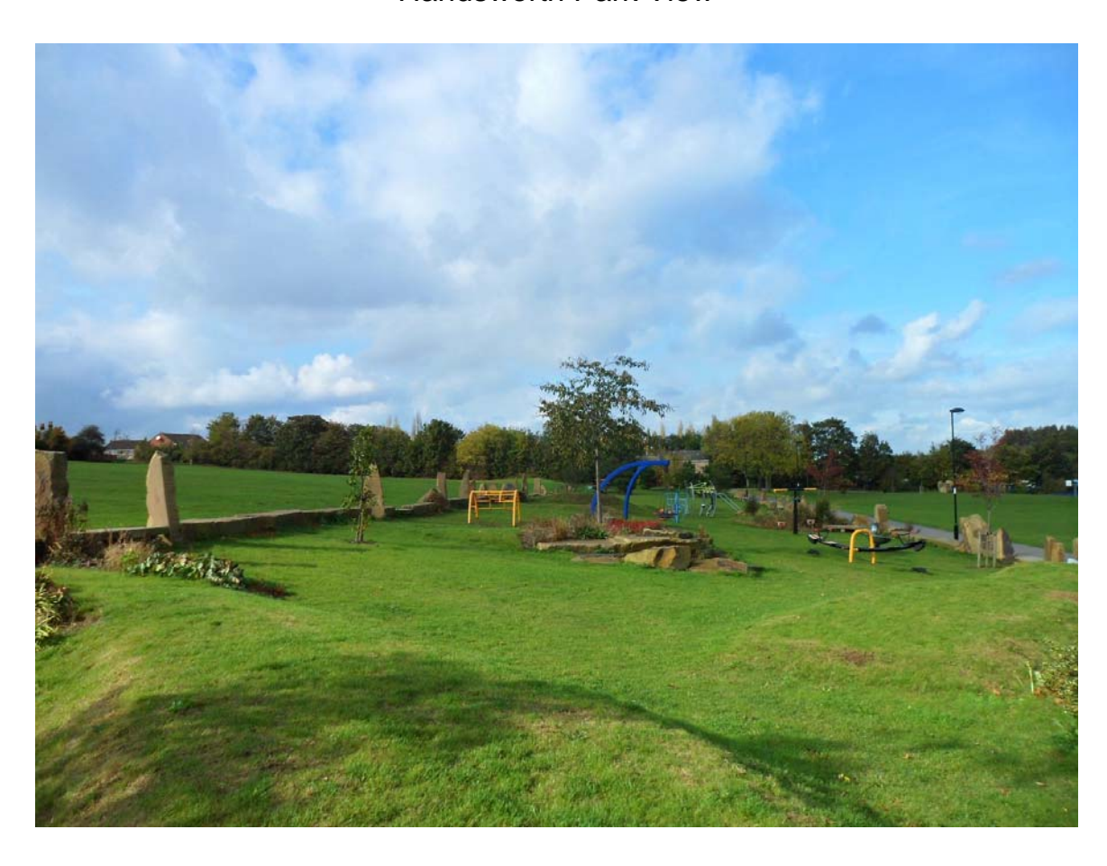
Children's Activity Frames