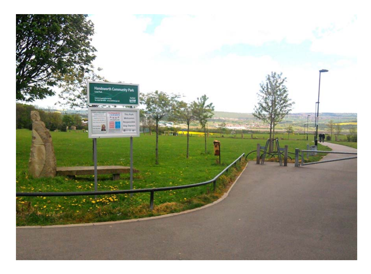
Handsworth Park Tarmac Path