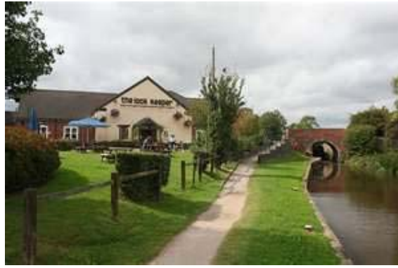
Lockkeeper Inn at the side of the canal

● Toilets - There are toilets at the various cafes and public houses near Kiveton, Shireoaks, Lockkeeper Inn and Worksop.