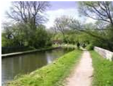
Canal Crushed Stone Towpath

You can do sections of the walk from Kiveton to Shireoaks to The Lockkeeper Inn and to Worksop.