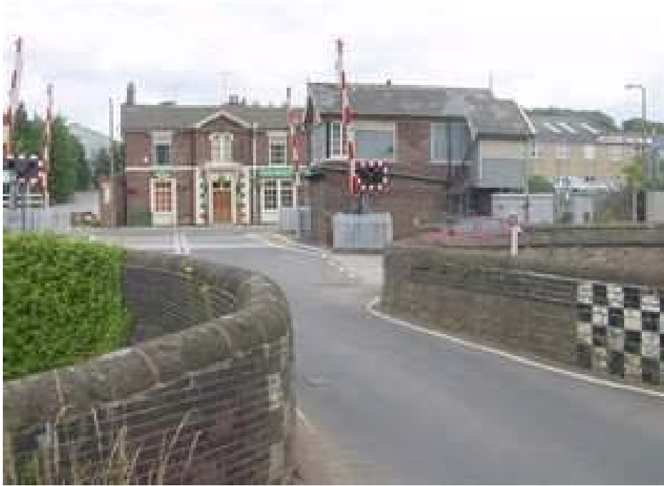
Kiveton Park Railway Station & Hotel