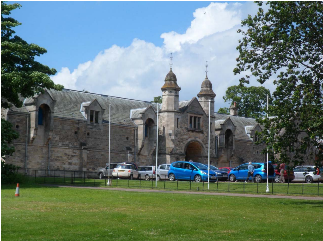
Thoresby Gallery Car Park and Café

● Café – At the Thoresby Hall Gallery there is an excellent café.