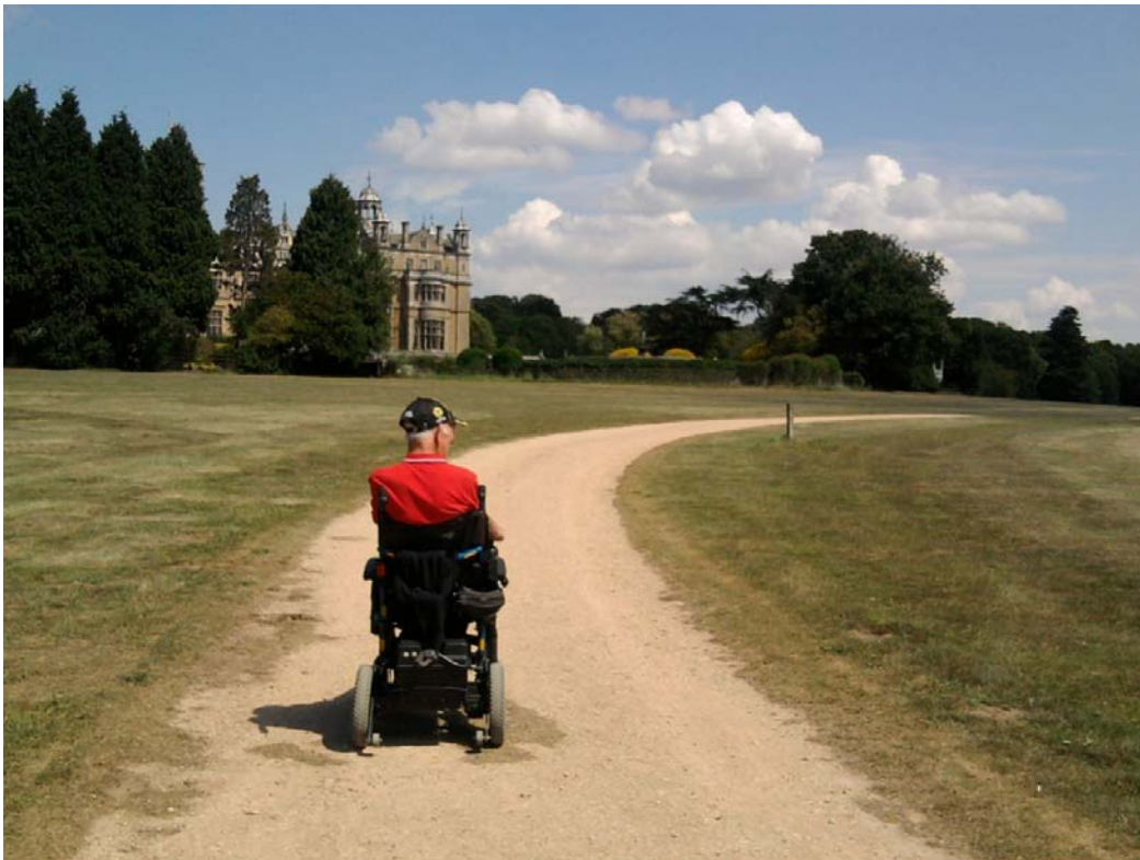
Crushed Stone Path