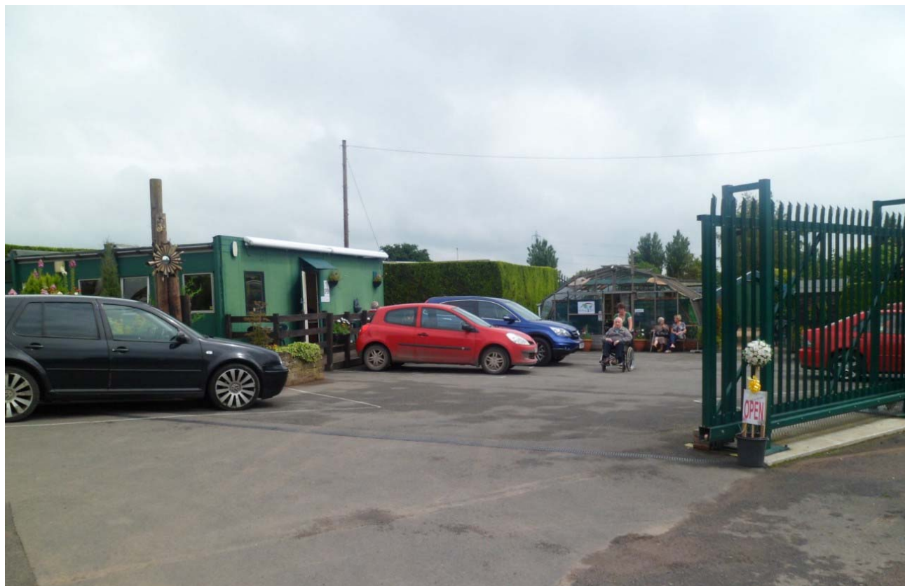
Entrance and Café