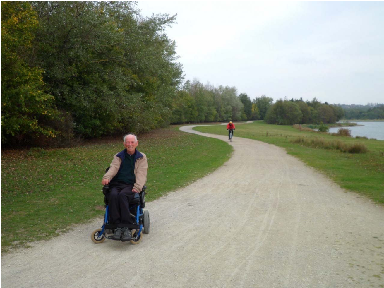
Crushed Stone Path