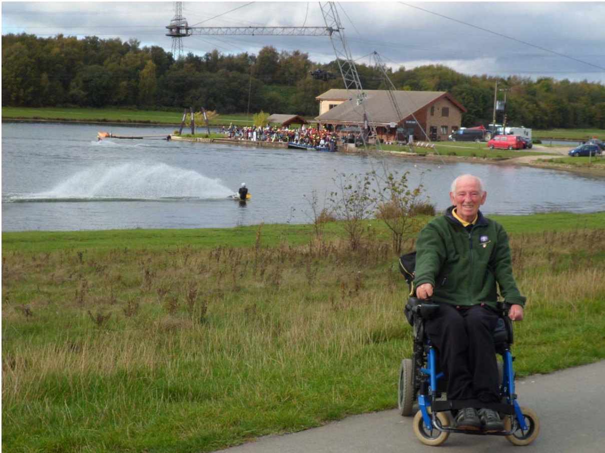
Water Ski Run