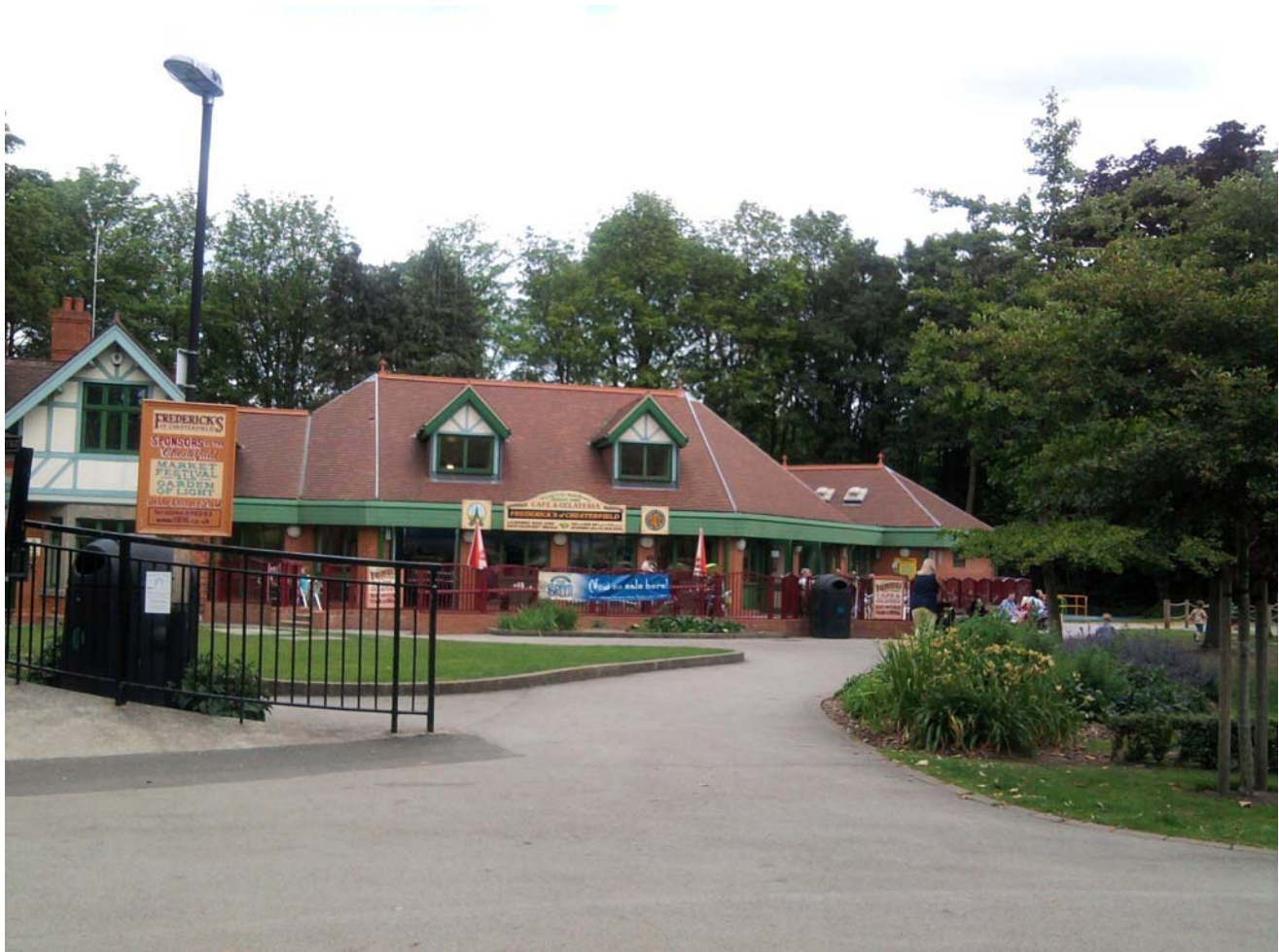
Queens Park Cafe