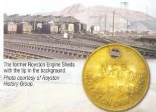
The former Royston Engine Sheds with the tip in the background.

After many years of seeking funds to carry out a reclamation scheme, the project has been supported through the National Coalfields Programme, originally administered through English Partnerships and now the responsibility of the Homes & Communities Agency. This Programme has provided the £5,250,000 required to regenerate the site.