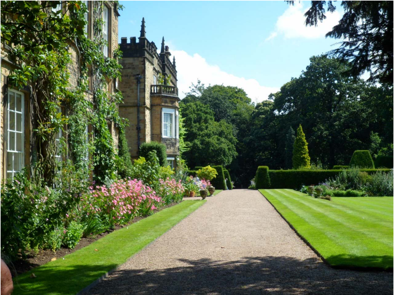
Firm gravel path