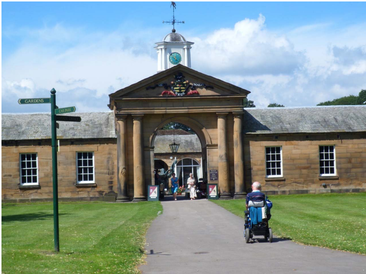
Renishaw Café & Shop Entrance