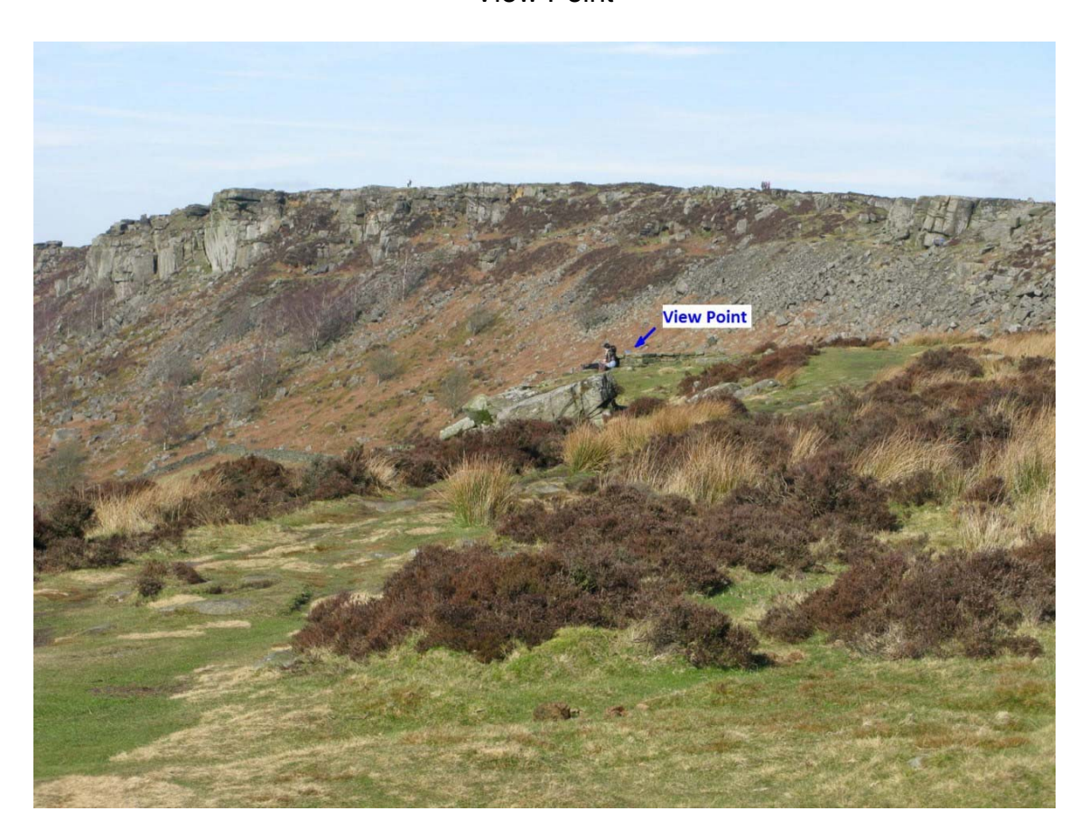
Car Park & Edge Location.