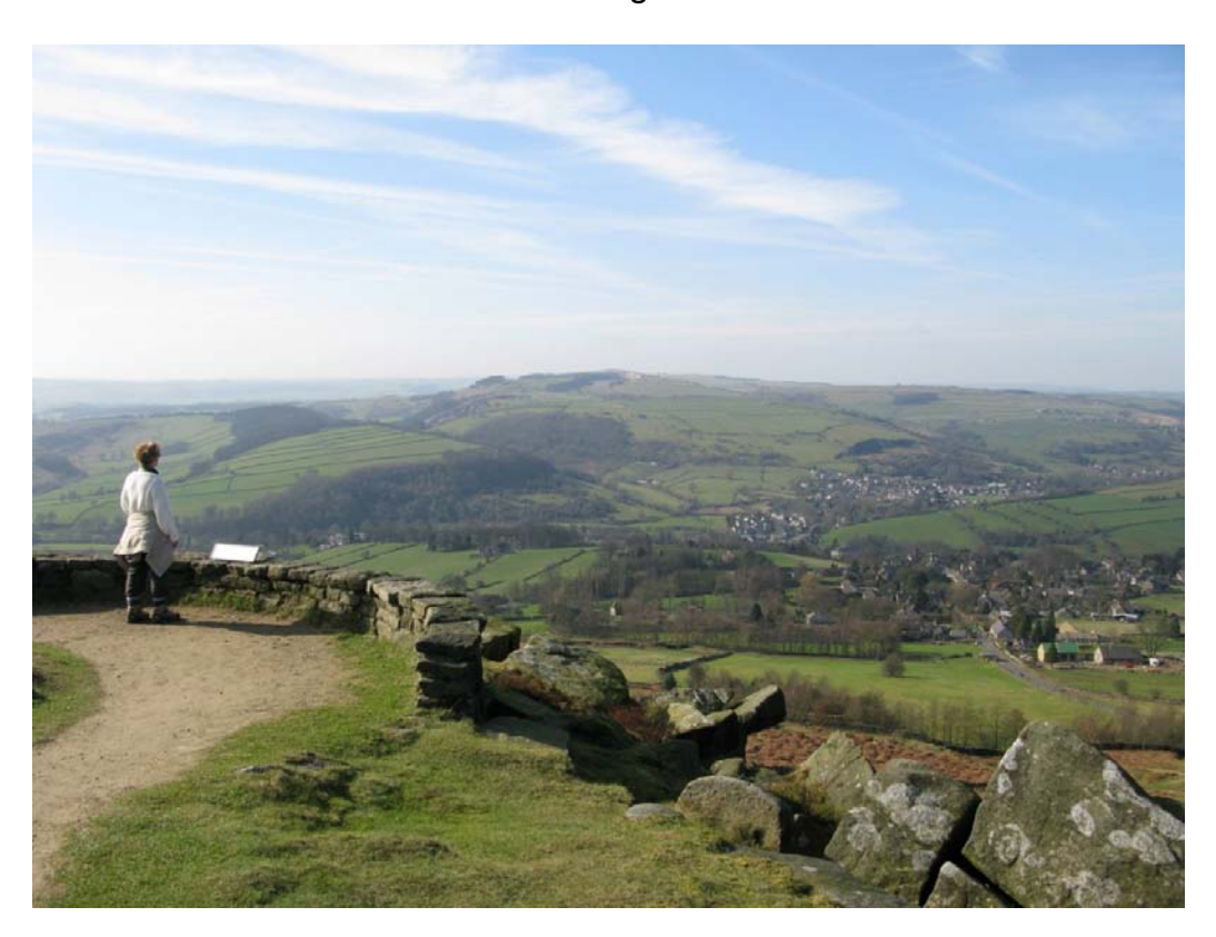
Crushed Stone Path