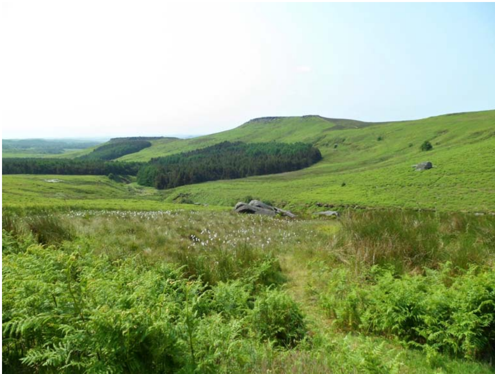
Carl Wark & Higger Tor