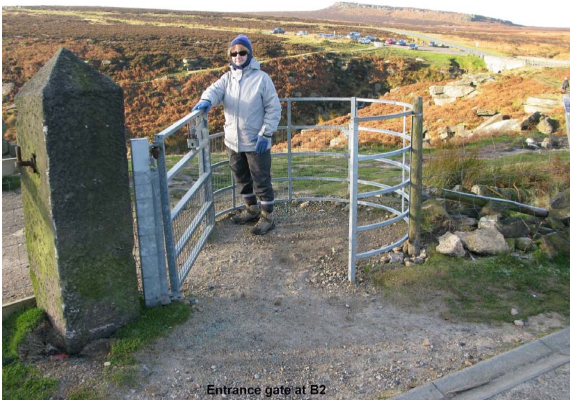
Entrance gate at B2