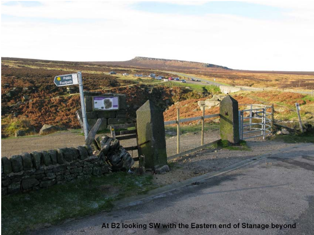
At B2 looking SW with the Eastern end of Stange beyond