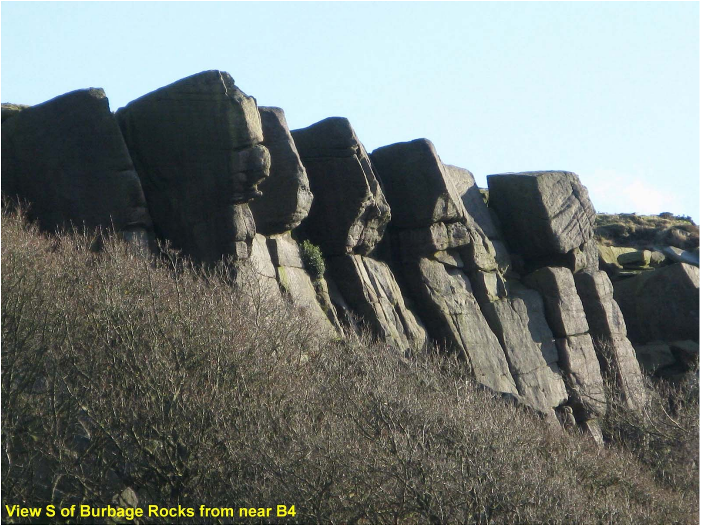
View S of Burbage Rocks from near B4