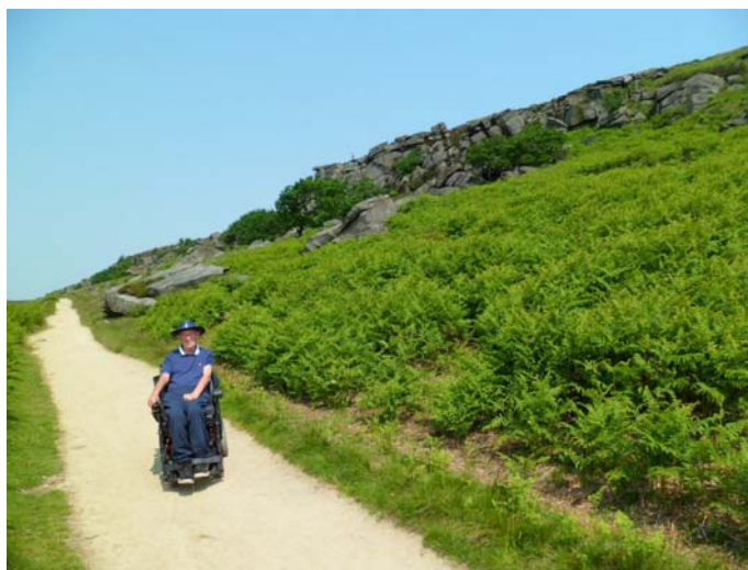
Sloping Crushed Stone Path

To help, Allen's map on the website is marked with the No. of the photo and direction the photo was taken – i.e. looking from B2 - S represents the photo taken in this position facing south.