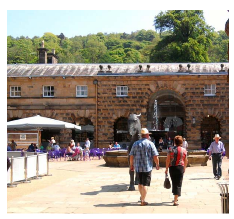
'The Stables' Restaurant and tearoom

• Café – Edensor has a Tea Cottage in the old post office where you can obtain snacks and a meal – at Chatsworth House 'The Stables' has a restaurant and a large self service café with a large seating area, there is also a seating outside – There is also a small snack cafe near the garden area.