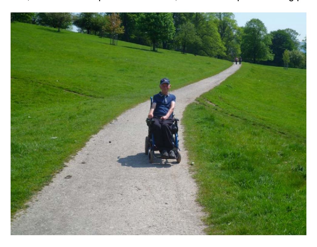
Crushed Stone Path

For people in manual wheelchairs you can park at Chatsworth House and there are a few flat areas, but also a hill up to 'The Stables', which will require a strong pusher.