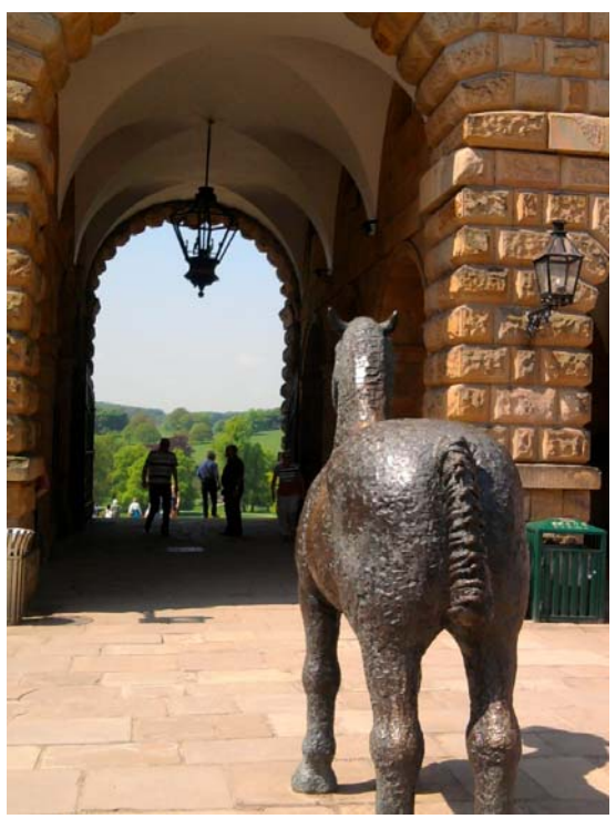
'The Stables' Entrance