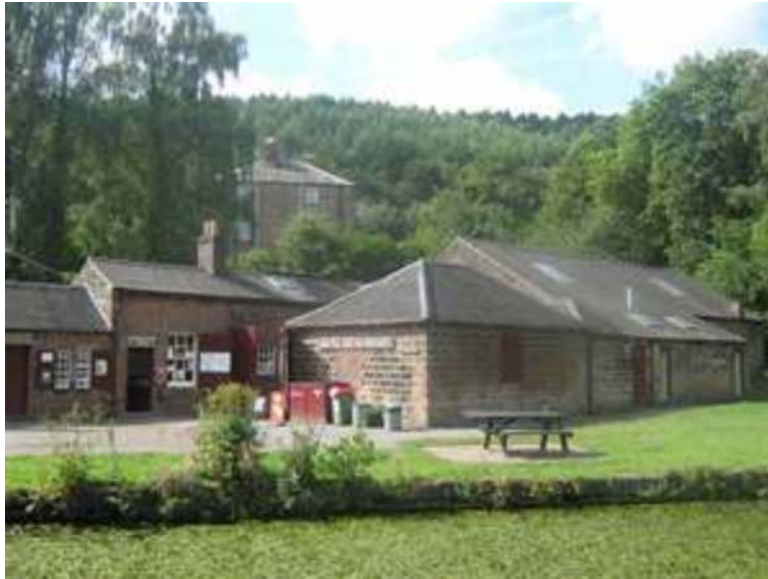
High Peak Junction