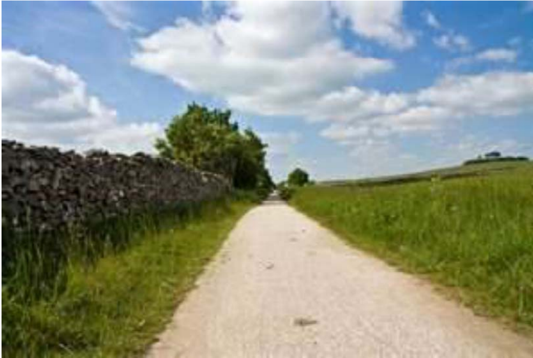
Crushed Stone Path

You will need to pick a parking place to start your walk as it is a there / back journey