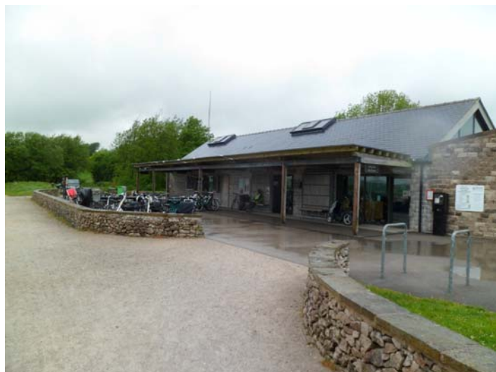
Parsley Hay Café

Opening times of cafes may vary. [ please check ].