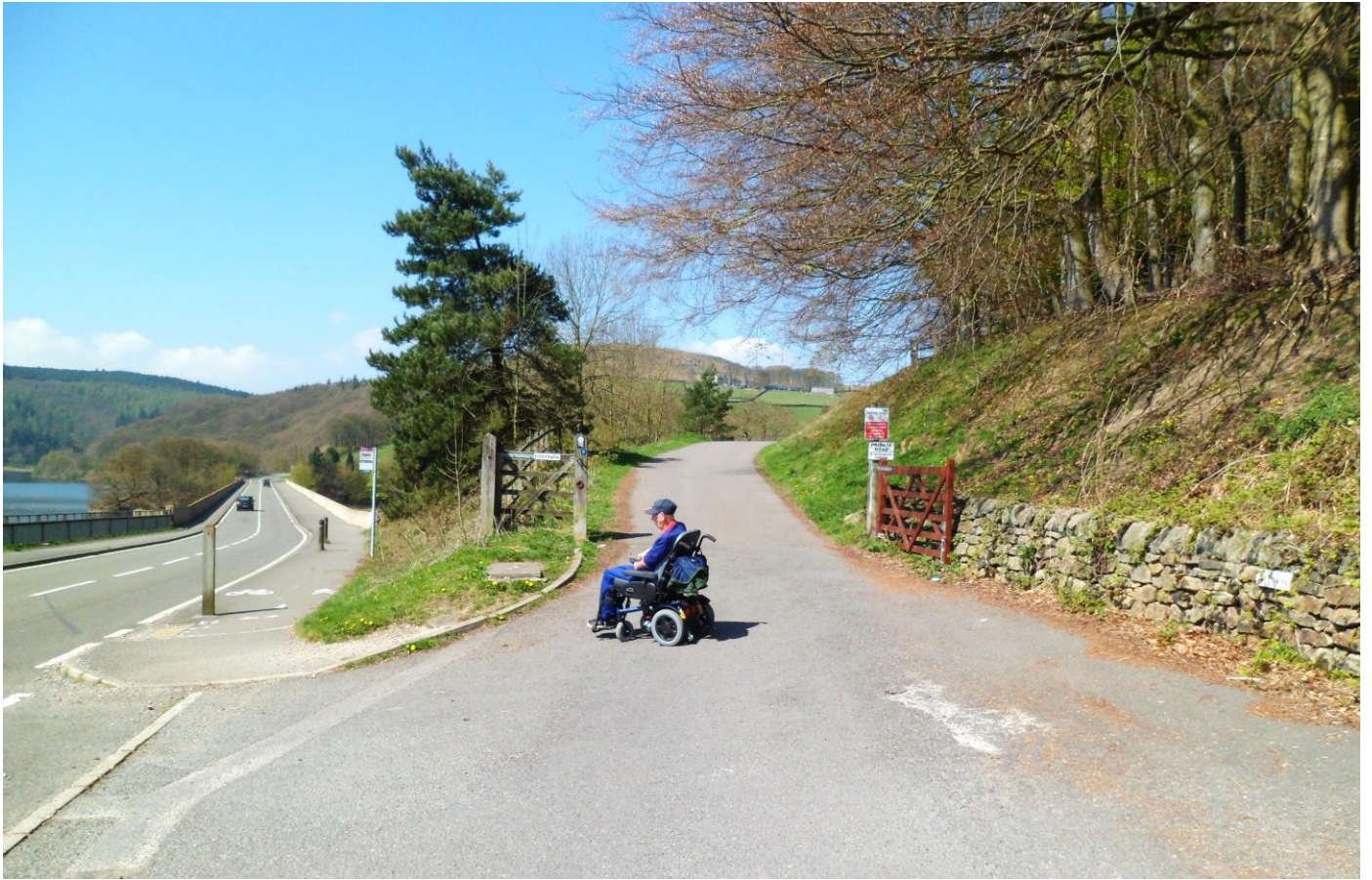
End of Path onto Roadway