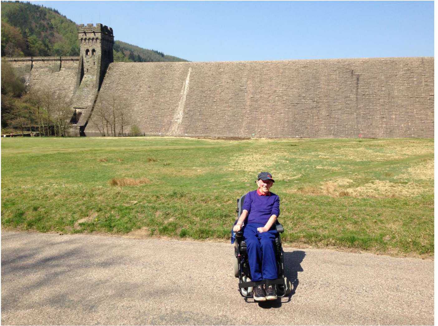
Ladybower Dam Wall