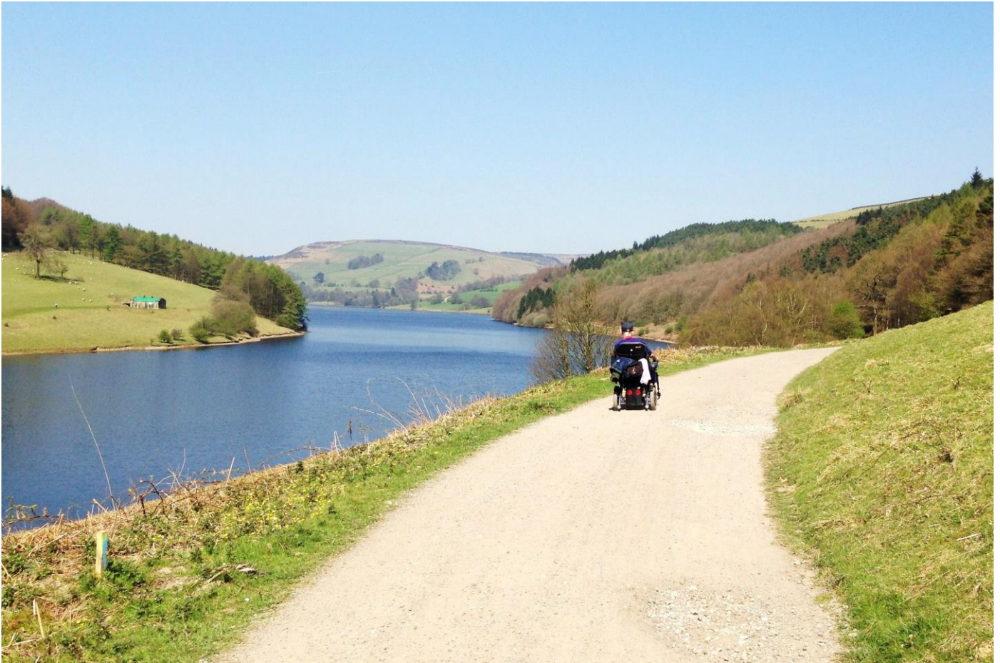
Crushed Stone Path