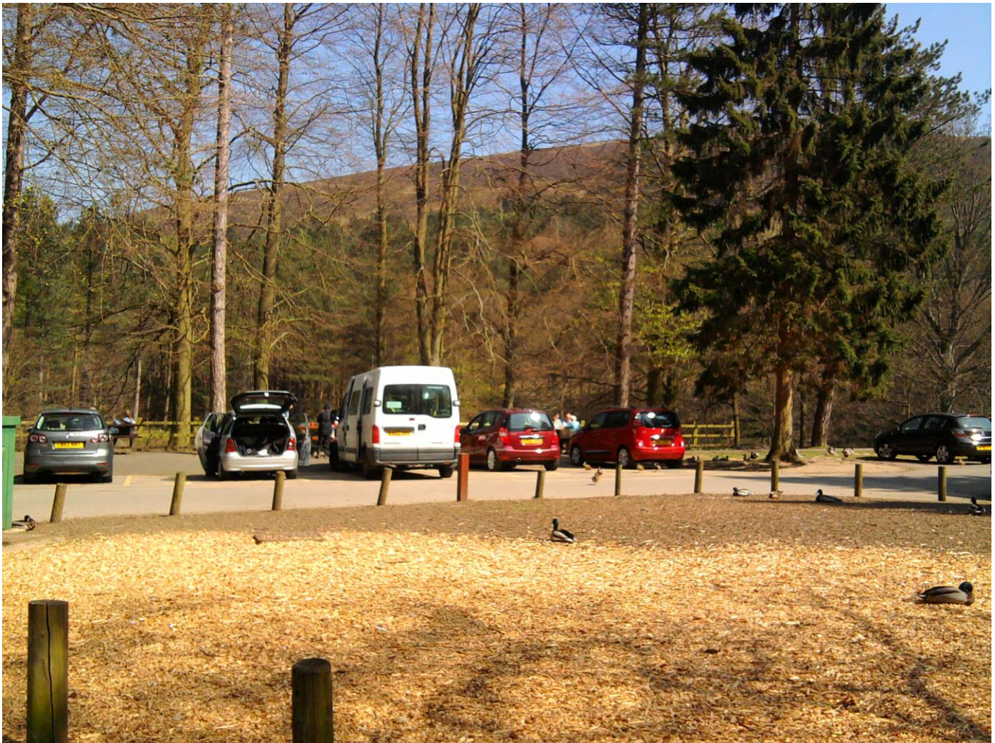
Visitors Centre Car Park

At the Fairholmes Visitors Centre is a pay and display car park, and there are also 2 other car parks nearby.