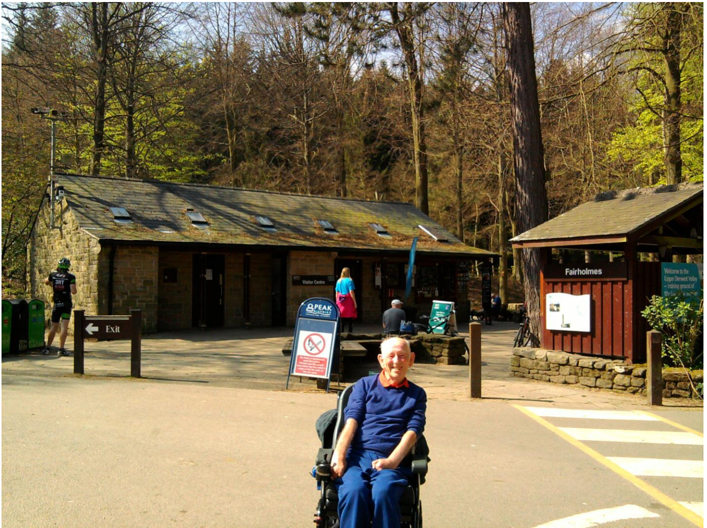
Fairholmes Visitors Centre