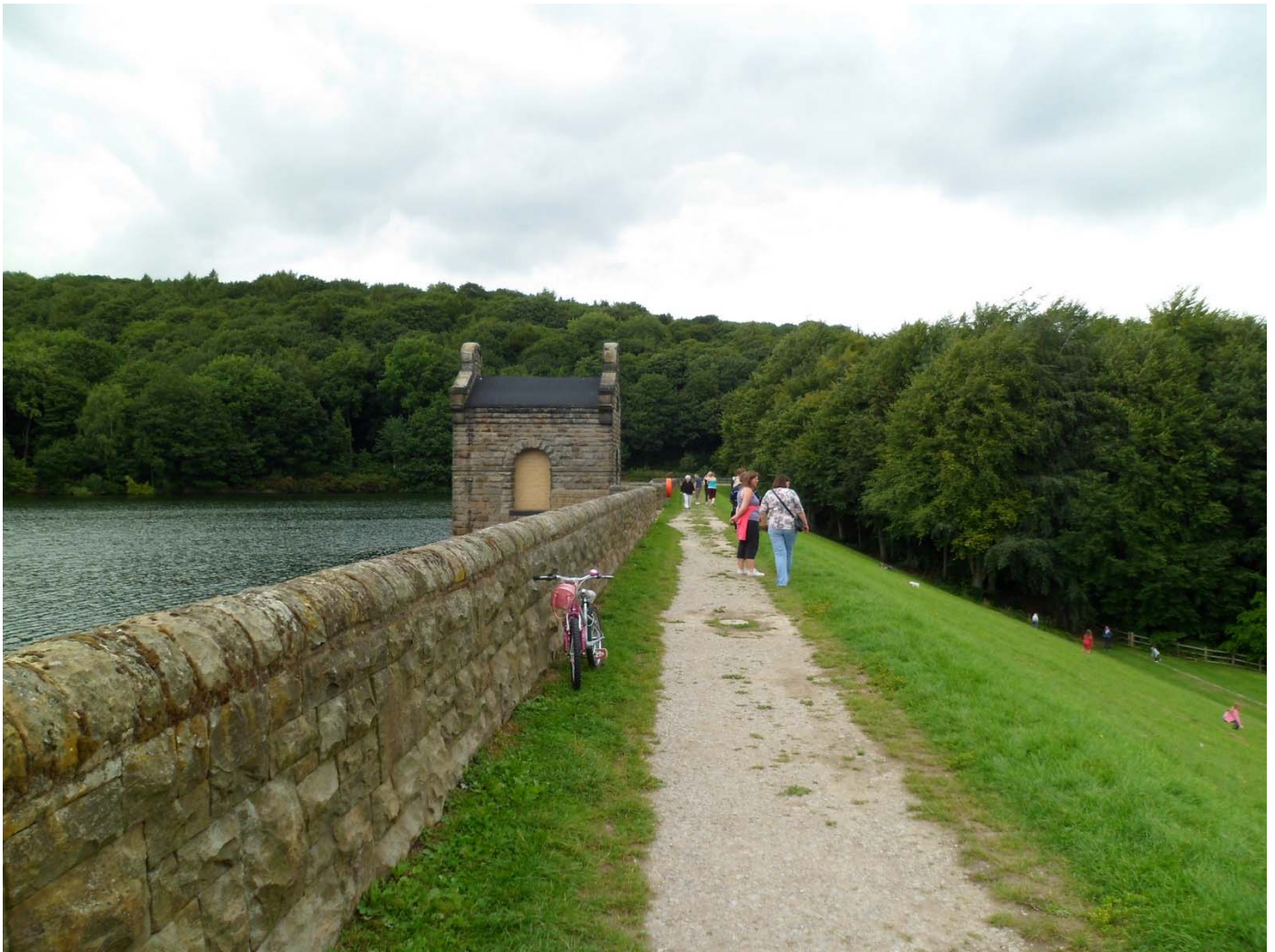
Crushed Stone Path