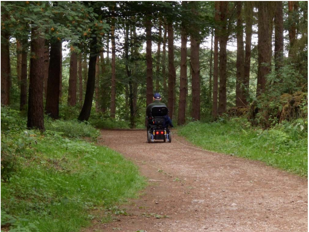
Pine Tree Forest