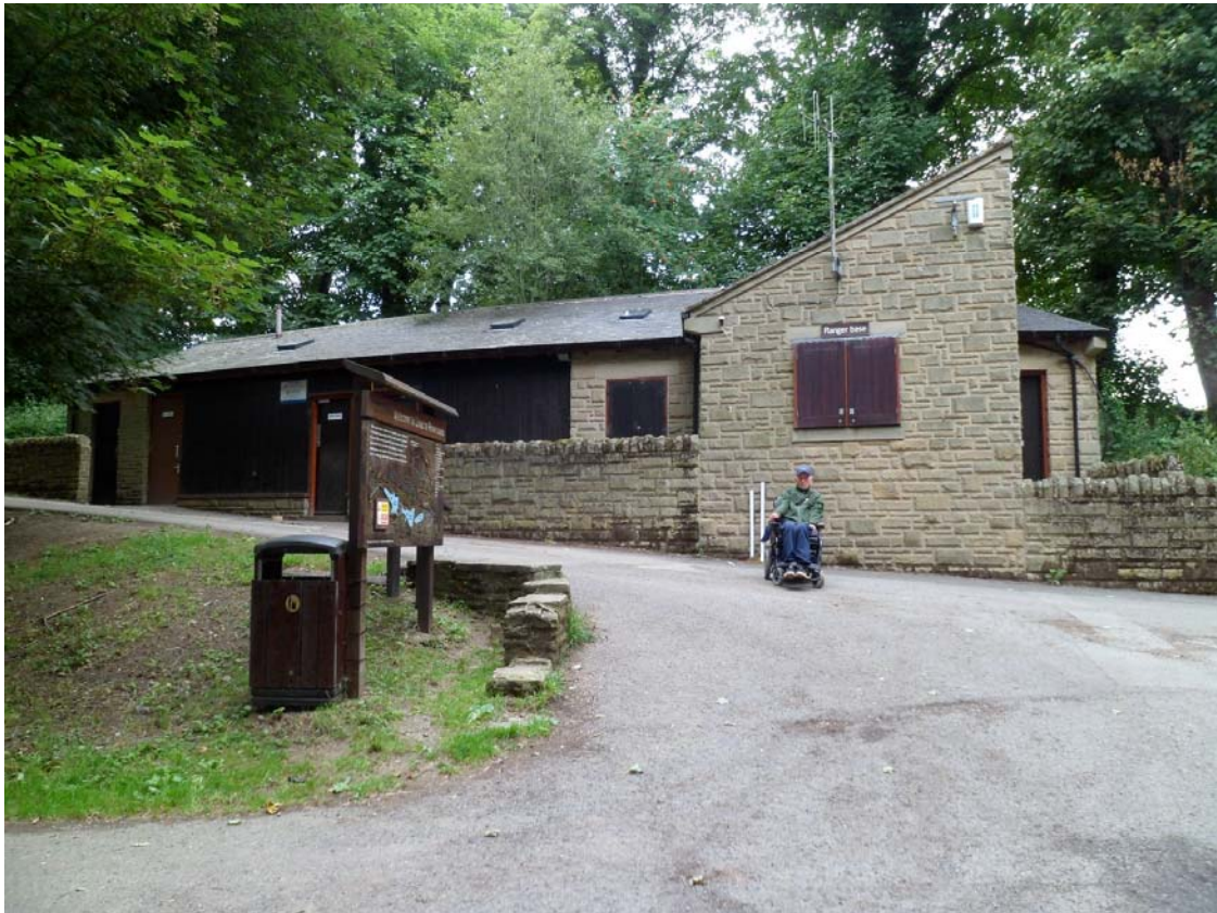
Park Rangers Office & Toilets