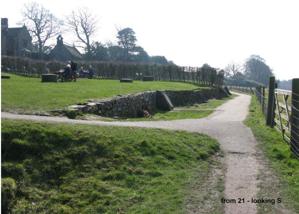
Longshaw Car Park