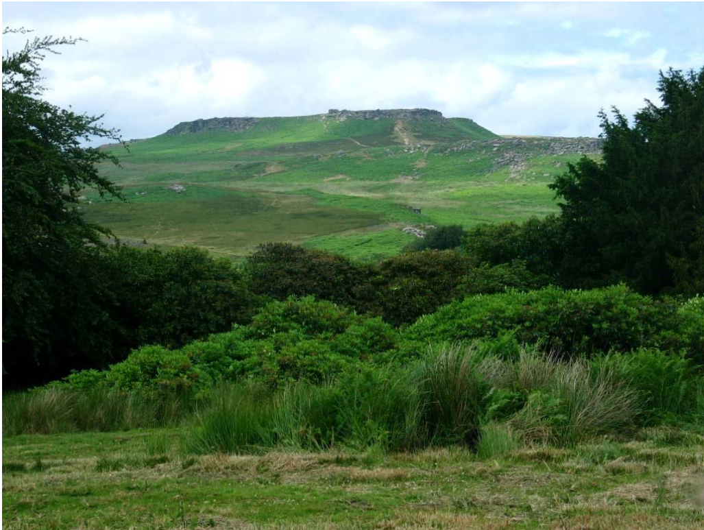
View of Higger Tor