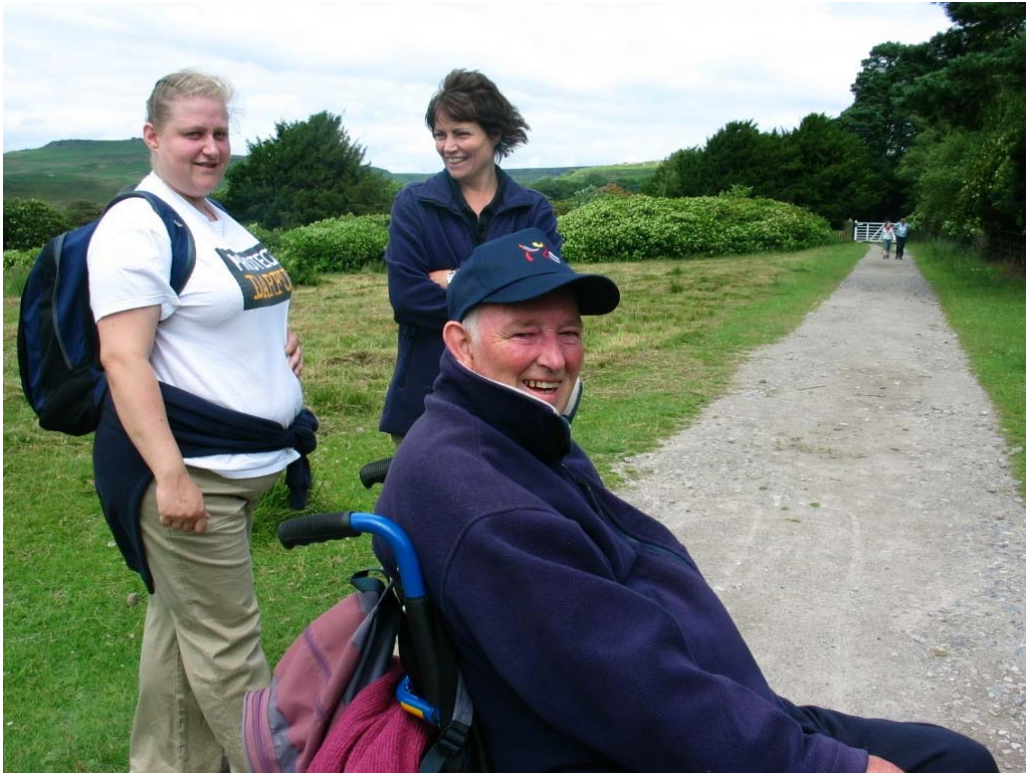
Crushed Stone Path

For walkers there are many other paths to make this into a round walk.