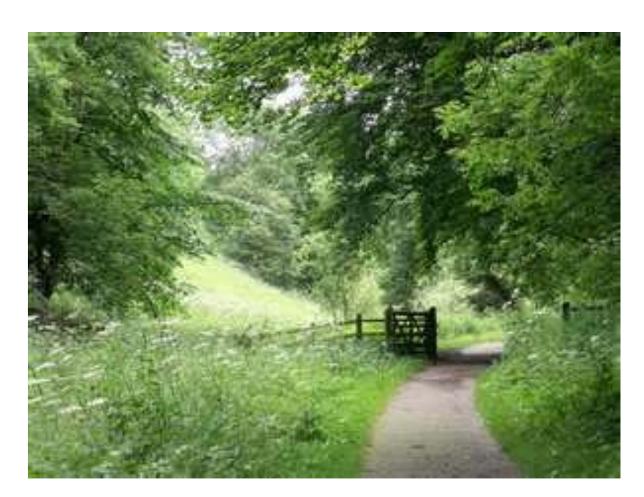
Crushed stone path