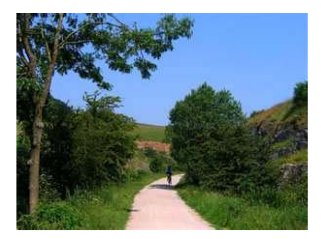
Crushed Stone Path

You will need to pick a parking place to start your walk as it is a there / back journey