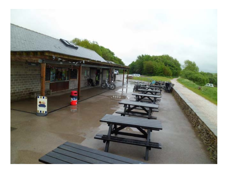
Parsley Hay Café

• Path – Most of the paths are made up of fine rolled-in crushed stone with some stretches of a tarmac surface, and there are some 'gravely' areas – there are also some quite long slopes which are only suitable for motorised wheelchairs - there are certain areas where a manual wheelchair with a pusher will only be able to go so far.